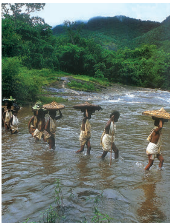
Fig. 1 – Women of the Dongria Kandha tribe in Orissa wade through the river on the way to the market

You have read about tribal societies last year. Most tribes had customs and rituals that were very different from those laid down by Brahmans. These societies also did not have the sharp social divisions that were characteristic of caste societies. All those who belonged to the same tribe thought of themselves as sharing common ties of kinship. However, this did not mean that there were no social and economic differences within tribes.