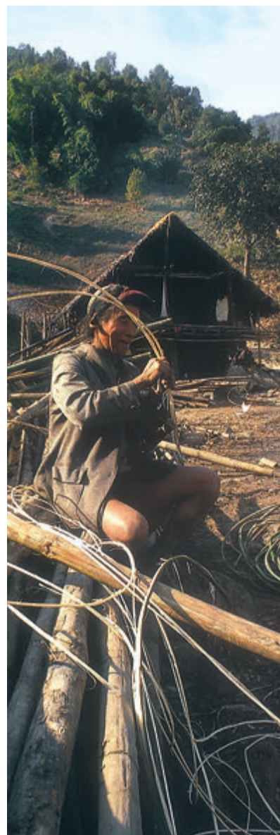
Fig. 5 – A log house being built in a village of the Nishi tribes of Arunachal Pradesh.

Bewar – A term used in Madhya Pradesh for shifting cultivation