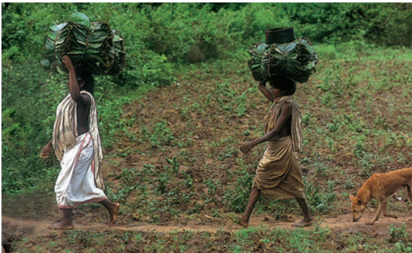
Fig. 2 – Dongria Kandha women in Orissa take home pandanus leaves from the forest to make plates

Mahua – A flower that is eaten or used to make alcohol