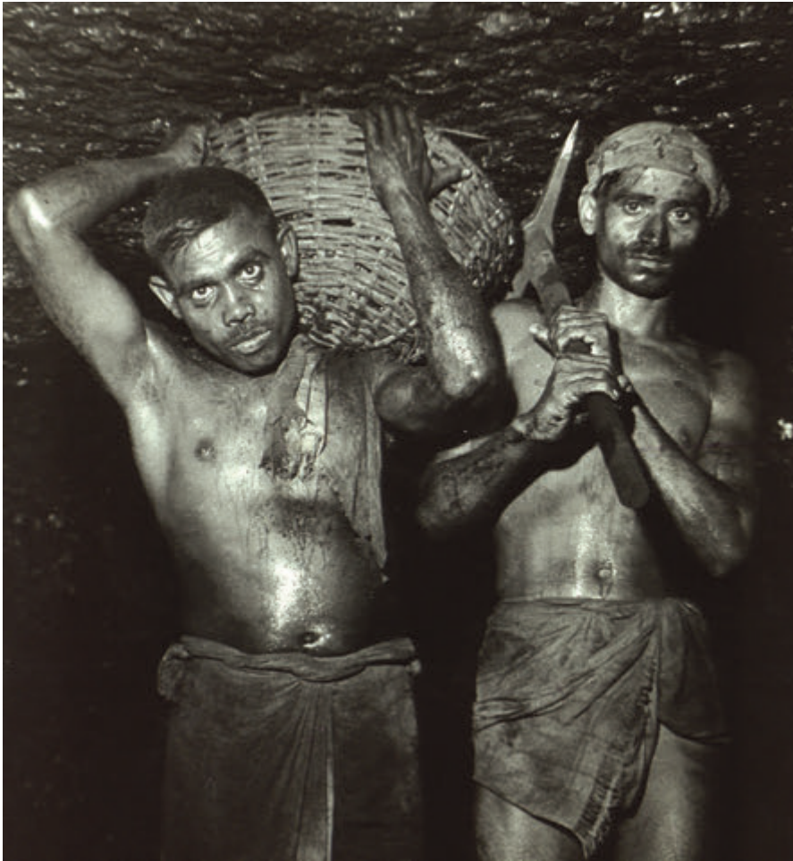
Fig. 10 – Coal miners of Bihar, 1948

In the 1920s about 50 per cent of the miners in the Jharia and Raniganj coal mines of Bihar were tribals. Work deep down in the dark and suffocating mines was not only back-breaking and dangerous, it was often literally killing. In the 1920s over 2,000 workers died every year in the coal mines in India.