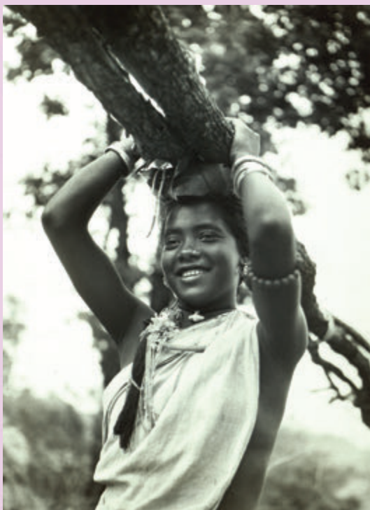
Fig. 4 – A Santhal girl carrying firewood, Bihar, 1946

Adapted from Verrier Elwin, Baiga (1939) and Elwin's unpublished 'Notes on the Khonds' (Verrier Elwin Papers, Nehru Memorial Museum and Library)