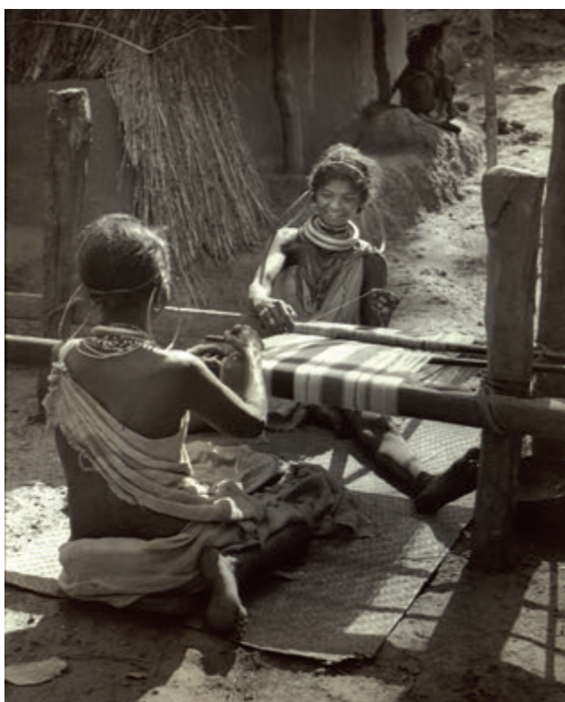
Fig. 8 – Godara women weaving

Many tribal groups reacted against the colonial forest laws. They disobeyed the new rules, continued with practices that were declared illegal, and at times rose in open rebellion. Such was the revolt of Songram Sangma in 1906 in Assam, and the forest satyagraha of the 1930s in the Central Provinces.