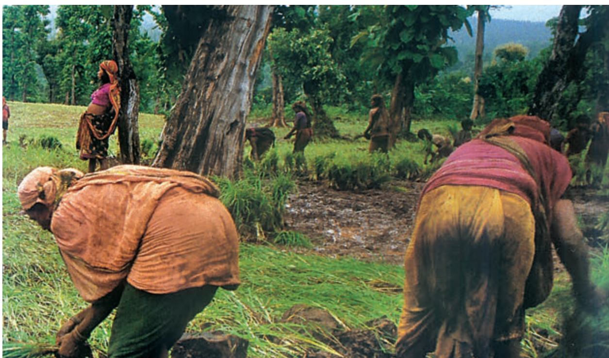
Fig. 6 – Bhil women cultivating in a forest in Gujarat

Shifting cultivation continues in many forest areas of Gujarat. You can see that trees have been cut and land cleared to create patches for cultivation.