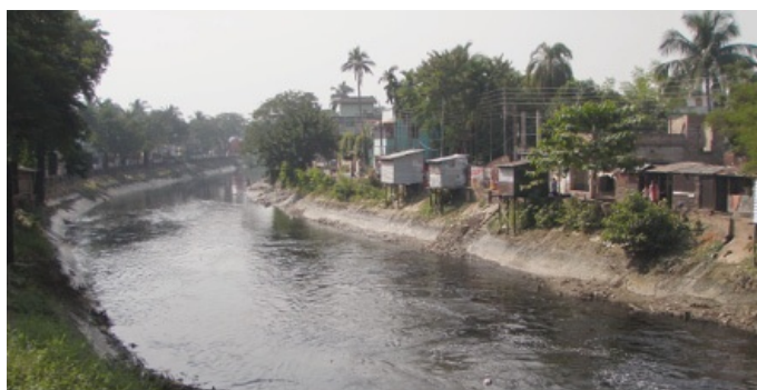
Fig. 8 Polluted water stream

Where is all of this pollution coming from?