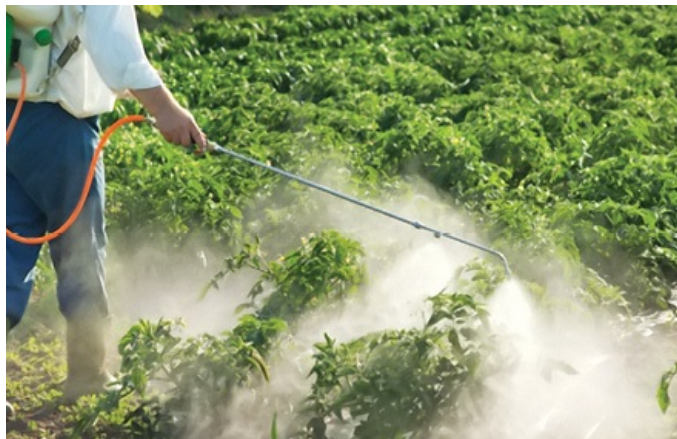
Fig. 5 Pesticides

In addition to these there are so many small power plants in our country which emits pollutants into air.