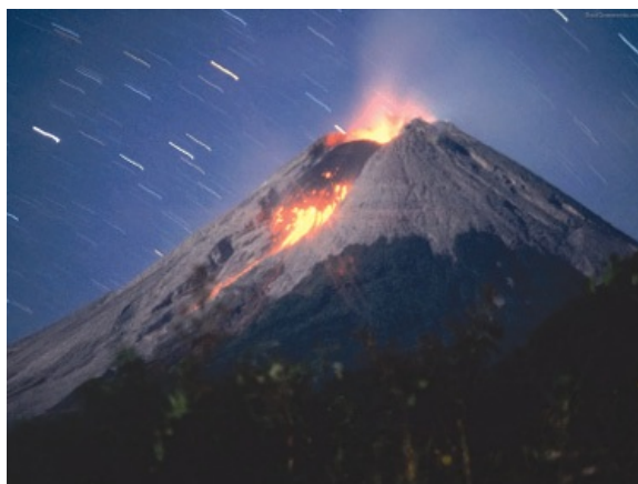
Fig. 3 Volcanic eruption