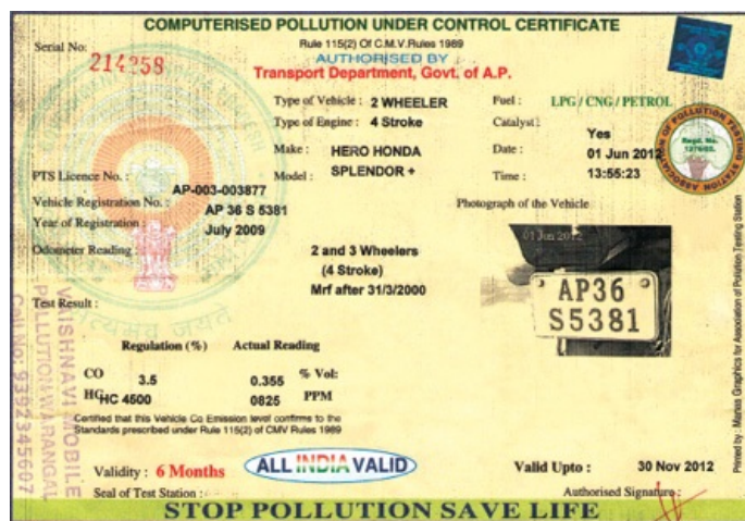
Fig. 2 Pollution certificate

Observe this certificate and try to find out answers for the following questions: