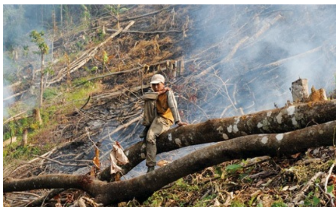
Fig. 6 Deforestation

Deforestation: It is the destruction of forests and woods. It has resulted in the reduction of indigenous forests. Forests now cover only 19% of the earth's land surface. Plants use carbon dioxide for the process of photosynthesis. Due to lack of forests the level of carbon dioxide is increasing day by day resulting to global warming.