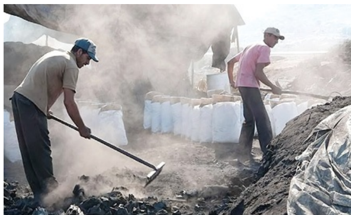
Fig. 7 Mining

Let us read the table given in the next page about pollutants and their sources.