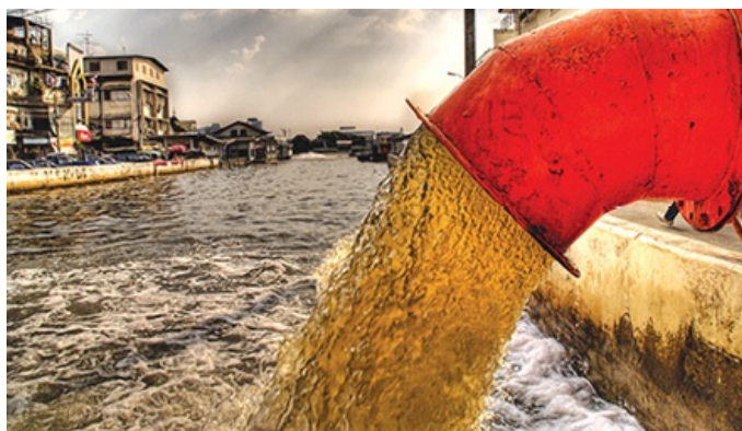
Fig. 9 Chemical pollutants

Heat: It can be a source of pollution in water. As the water temperature increases, the amount of dissolved oxygen decreases. Thermal pollution can be natural, in case of hot springs and shallow ponds during summer. The discharge of water that has been used to cool power plants or other industrial equipment is another reason. Fish and plants require certain temperatures and oxygen levels to survive. So thermal pollution often reduces the aquatic life diversity in the water.