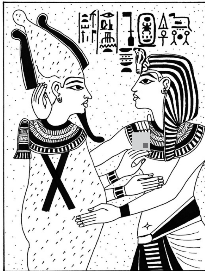
Mural in King Tut's tomb showing King Tut with Osiris, the god of the afterlife

Back in the trailer a technician pulled up astonishing images of Tut on a computer screen. A grey head took shape from a scattering of pixels, and the technician spun and tilted it in every direction. Neck vertebrae appeared as clearly as in an anatomy class. Other images revealed a hand, several views of the rib cage, and a transection of the skull. But for now the pressure was off. Sitting back in his chair, Zahi Hawass smiled, visibly relieved that nothing had gone seriously wrong. "I didn't sleep last night, not for a second," he said. "I was so worried. But now I think I will go and sleep."