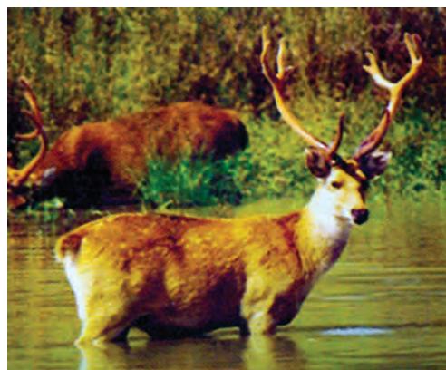
Fig. 7.6 : Barasingha

animals has become difficult because of disturbances in their natural habitat. Professor Ahmad tells them that in order to protect plants and animals strict rules are imposed in all National Parks. Human activities such as grazing, poaching, hunting, capturing of animals or collection of firewood, medicinal plants, etc. are not allowed