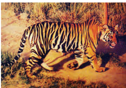
Fig. 7.4 : Tiger

Tiger (Fig. 7.4) is one of the many species which are slowly disappearing from our forests. But, the Satpura Tiger Reserve is unique in the sense that a significant increase in the population of tigers has been seen here. Once upon a time, animals like lions, elephants, wild