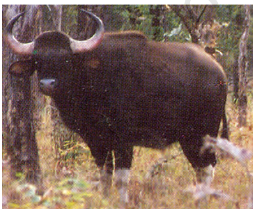
Fig. 7.5 : Wild buffalo

buffaloes (Fig. 7.5) and barasingha (Fig. 7.6) were also found in the Satpura National Park. Animals whose numbers are diminishing to a level that they might face extinction are known as the endangered animals . Boojho is reminded of the dinosaurs which became extinct a long time ago. Survival of some