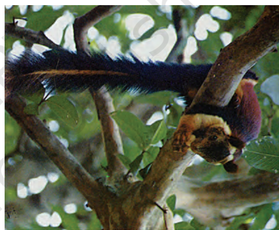
Fig. 7.3 (b) : Giant squirrel

endemic flora of the Pachmarhi Biosphere Reserve. Bison, Indian giant squirrel [Fig. 7.3 (b)] and flying squirrel are endemic fauna of this area. Professor Ahmad explains that the destruction of their habitat, increasing population and introduction of new species may affect the natural habitat of endemic species and endanger their existence.