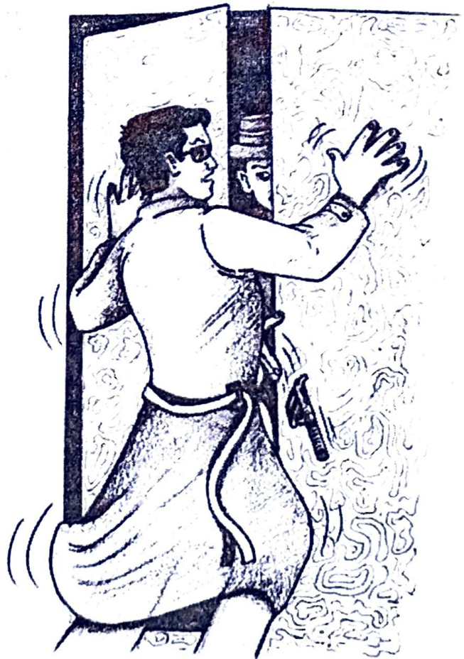
Gerrard gives him a push into the cupboard...

GERRARD : I have got a man posted on the main road. He'll ring up if he sees the