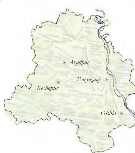
The above map of Delhi shows four of the 10 wholesale markets in the city.