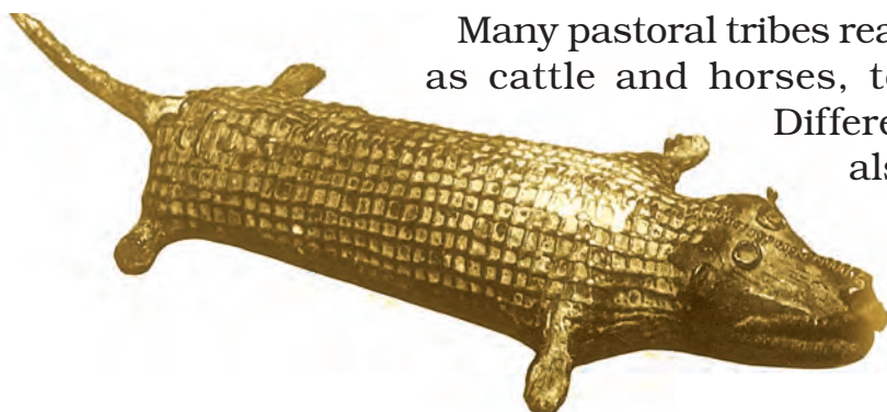
Fig. 4 Bronze crocodile, Kutiya Kond tribe, Orissa.

Many pastoral tribes reared and sold animals, such as cattle and horses, to the prosperous people.