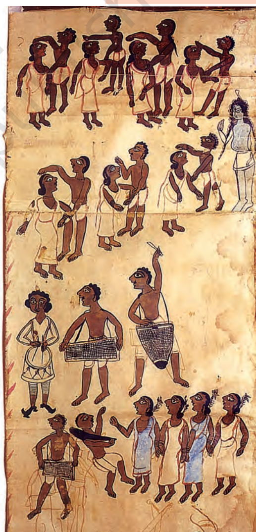
Fig. 1 Tribal dance, Santal painted scroll.

There were, however, other kinds of societies as well. Many societies in the subcontinent did not follow the social rules and rituals prescribed by the Brahmanas. Nor were they divided into numerous unequal classes. Such societies are often called tribes.