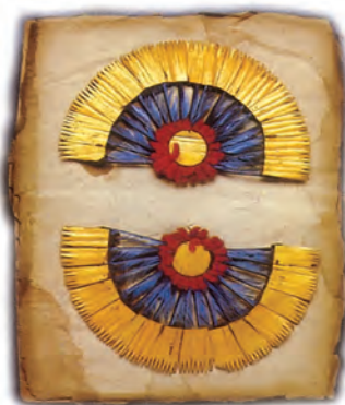
Fig. 7 Ear ornaments, Kobo Naga tribe, Manipur.