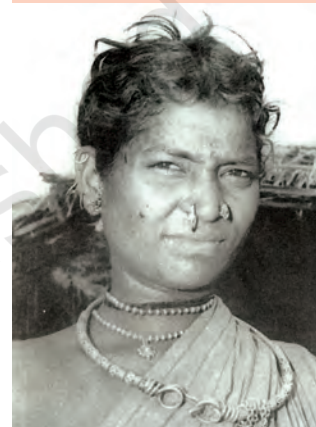
Fig. 5 A Gond woman.

The administrative system of these kingdoms was becoming centralised. The kingdom was divided into