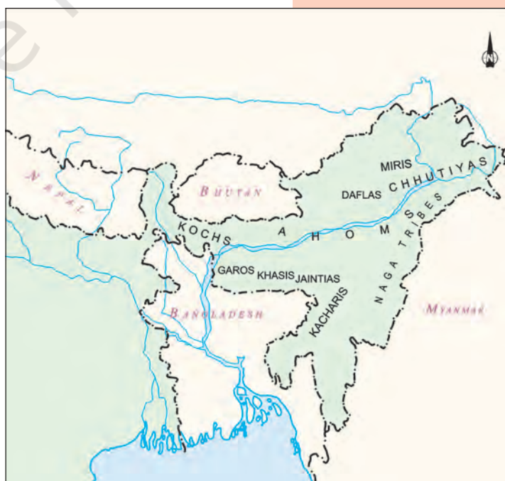
Map 3 Tribes of eastern India.

Discuss why the Mughals were interested in the land of the Gonds.