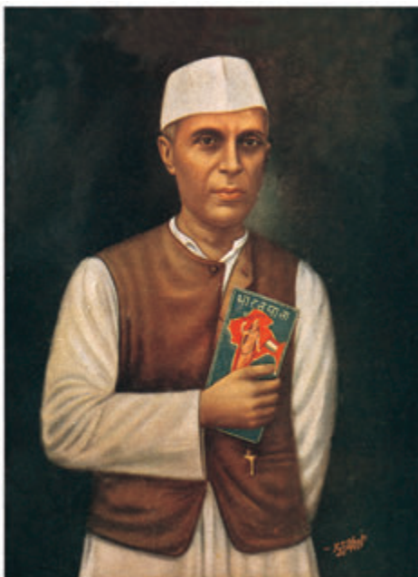
Fig. 13 – Jawaharlal Nehru, a popular print.

Notice that the mother figure here is shown as dispensing learning, food and clothing. The mala in one hand emphasises her ascetic quality. Abanindranath Tagore, like Ravi Varma before him, tried to develop a style of painting that could be seen as truly Indian.