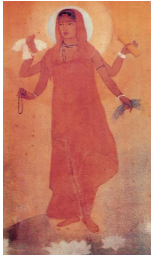
Fig. 12 – Bharat Mata, Abanindranath Tagore, 1905.

Ideas of nationalism also developed through a movement to revive Indian folklore. In late-nineteenth-century India, nationalists began recording folk tales sung by bards and they toured villages to gather folk songs and legends. These tales, they believed, gave a true picture of traditional culture that had been corrupted and damaged by outside forces. It was essential to preserve this folk tradition in order to discover one’s national identity and restore a sense of pride in one’s past. In Bengal, Rabindranath Tagore himself began collecting ballads, nursery rhymes and myths, and led the movement for folk