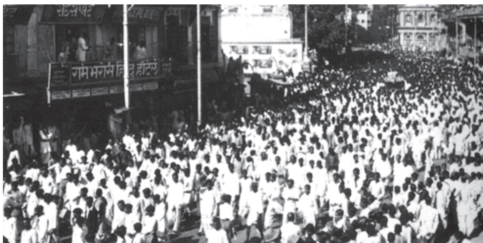
Fig. 1 – 6 April 1919. Mass processions on the streets became a common feature during the national movement.

In an earlier textbook you have read about the growth of nationalism in India up to the first decade of the twentieth century. In this chapter we will pick up the story from the 1920s and study the Non-Cooperation and Civil Disobedience Movements. We will explore how the Congress sought to develop the national movement, how different social groups participated in the movement, and how nationalism captured the imagination of people.