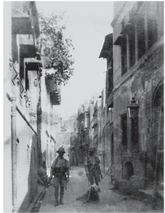
Fig. 3 – General Dyer's 'crawling orders' being administered by British soldiers, Amritsar, Punjab, 1919.

In his famous book Hind Swaraj (1909) Mahatma Gandhi declared that British rule was established in India with the cooperation of