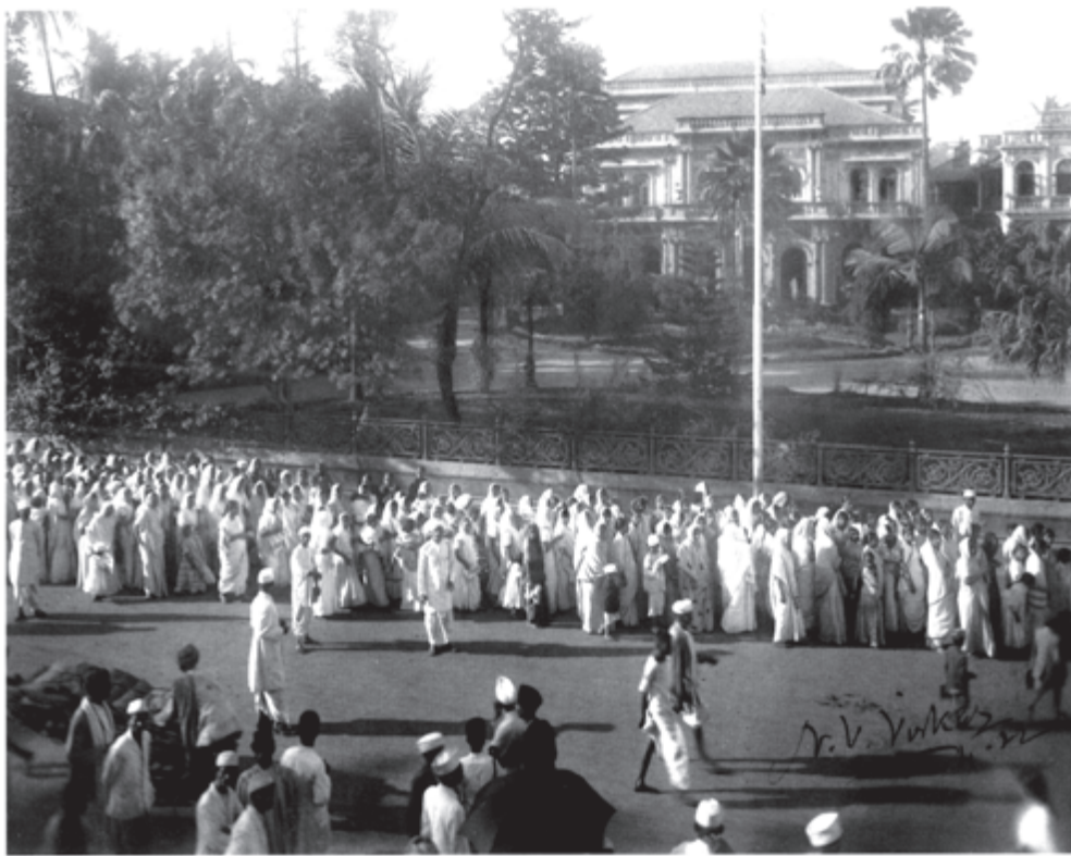
Fig. 9 – Women join nationalist processions. During the national movement, many women, for the first time in their lives, moved out of their homes on to a public arena. Amongst the marchers you can see many old women, and mothers with children in their arms.

picketed foreign cloth and liquor shops. Many went to jail. In urban areas these women were from high-caste families; in rural areas they came from rich peasant households. Moved by Gandhiji's call, they began to see service to the nation as a sacred duty of women. Yet, this increased public role did not necessarily mean any radical change in the way the position of women was visualised. Gandhiji was convinced that it was the duty of women to look after home and hearth, be good mothers and good wives. And for a long time the Congress was reluctant to allow women to hold any position of authority within the organisation. It was keen only on their symbolic presence.