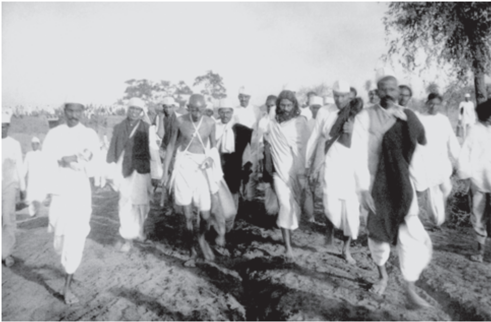
Fig. 7 – The Dandi march. During the salt march Mahatma Gandhi was accompanied by 78 volunteers. On the way they were joined by thousands.

with the British, as they had done in 1921-22, but also to break colonial laws. Thousands in different parts of the country broke the salt law, manufactured salt and demonstrated in front of government salt factories. As the movement spread, foreign cloth was boycotted, and liquor shops were picketed. Peasants refused to pay revenue and chaukidari taxes, village officials resigned, and in many places forest people violated forest laws – going into Reserved Forests to collect wood and graze cattle.