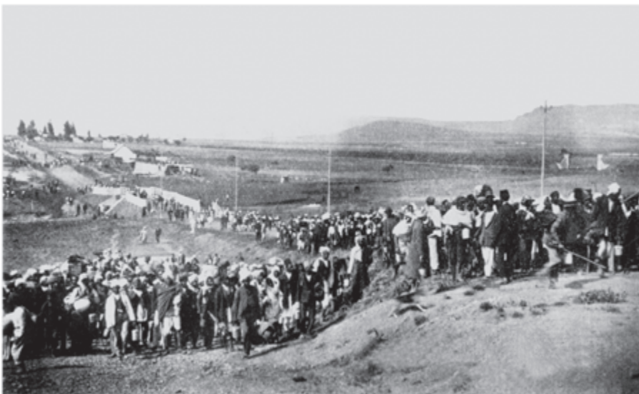
Fig. 2 – Indian workers in South Africa march through Volksrust, 6 November 1913.

Mahatma Gandhi returned to India in January 1915. As you know, he had come from South Africa where he had successfully fought