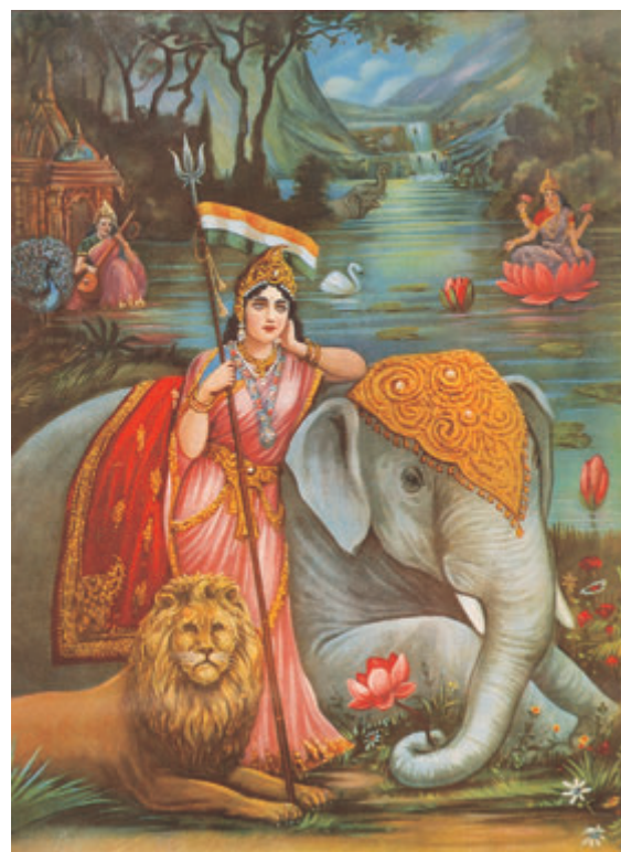
Fig. 14a – Bharat Mata.

This figure of Bharat Mata is a contrast to the one painted by Abanindranath Tagore. Here she is shown with a trishul, standing beside a lion and an elephant – both symbols of power and authority.