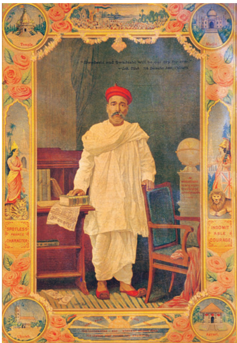
Fig. 11 – Bal Gangadhar Tilak, an early-twentieth-century print.

Notice how Tilak is surrounded by symbols of unity. The sacred institutions of different faiths (temple, church, masjid) frame the central figure.