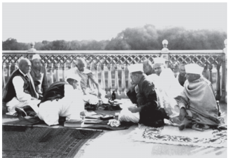
Fig. 6 – Meeting of Congress leaders at Allahabad, 1931. Apart from Mahatma Gandhi, you can see Sardar Vallabhbhai Patel (extreme left), Jawaharlal Nehru (extreme right) and Subhas Chandra Bose (fifth from right).

Lala Lajpat Rai was assaulted by the British police during a peaceful demonstration against the Simon Commission. He succumbed to injuries that were inflicted on him during the demonstration.