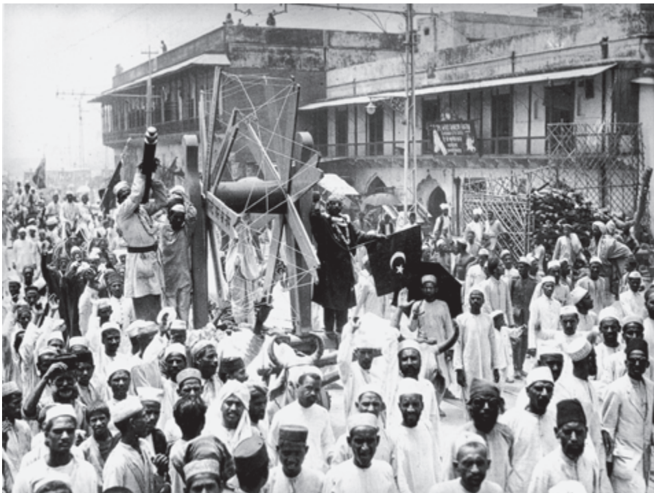
Fig. 4 – The boycott of foreign cloth, July 1922. Foreign cloth was seen as the symbol of Western economic and cultural domination.

Boycott – The refusal to deal and associate with people, or participate in activities, or buy and use things; usually a form of protest