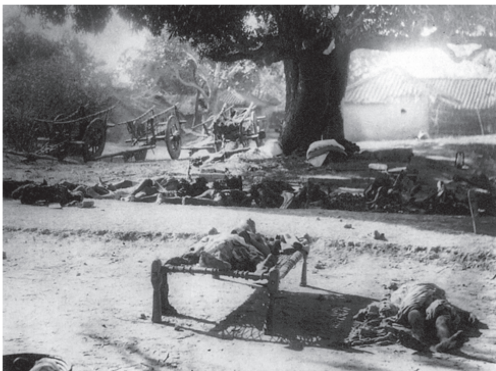
Fig. 5 – Chauri Chaura, 1922.

The visions of these movements were not defined by the Congress programme. They interpreted the term swaraj in their own ways, imagining it to be a time when all suffering and all troubles would be over. Yet, when the tribals chanted Gandhiji's name and raised slogans demanding ' Swatantra Bharat ', they were also emotionally relating to an all-India agitation. When they acted in the name of Mahatma Gandhi, or linked their movement to that of the Congress, they were identifying with a movement which went beyond the limits of their immediate locality.