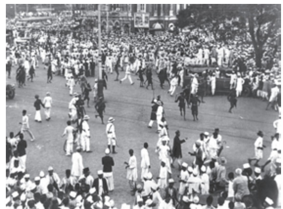
Fig. 8 – Police cracked down on satyagrahis, 1930.

In such a situation, Mahatma Gandhi once again decided to call off the movement and entered into a pact with Irwin on 5 March 1931. By this Gandhi-Irwin Pact, Gandhiji consented to participate in a Round Table Conference (the Congress had boycotted the first