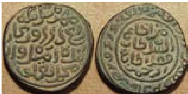
Coins of Muhammad-bin-Tughluq

Tughluq changed the Ala-ud-din's system of revenue collections in grain and ordered that land revenue, which was increased, should henceforward be collected in money. This proved disastrous during famines. When he discovered that the stock of coins and silver was inadequate for minting, he issued a token currency in copper. Counterfeiting soon became order of the day and, as a result, the entire revenue system collapsed. Trade suffered as foreign merchants stopped business. This forced Sultan to withdraw the token currency and pay gold and silver coins in exchange. This move led the state to become bankrupt. Tughluq increased land tax in the Doab region, which triggered peasant revolts. As the revolts were cruelly dealt with, peasants abandoned cultivation, which resulted in the outbreak of frequent famines.