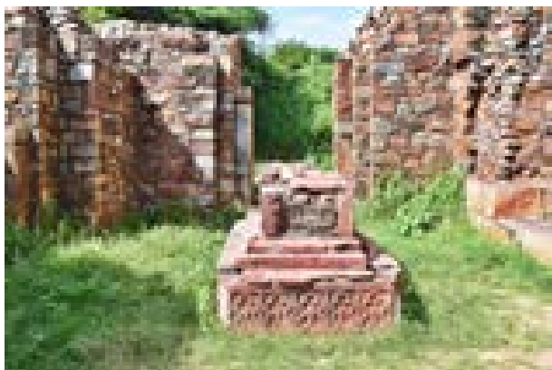
Tomb of Balban

After Razia, three weak rulers in succession ascended the throne. After them came Ghiyas-ud-din Balban. Balban abolished The Forty as it was hostile to him. He established a department of spies to gather intelligence about the conspirators and the trouble makers against his rule. He dealt with insubordination and defiance of royal authority sternly. Tughril Khan, a provincial governor of Bengal, who raised a banner of revolt against Balban, was captured and beheaded. He was ruthless in dealing with enemies like Meos of Mewat (a Muslim Rajput community from north-western India). Balban, however, took care to maintain