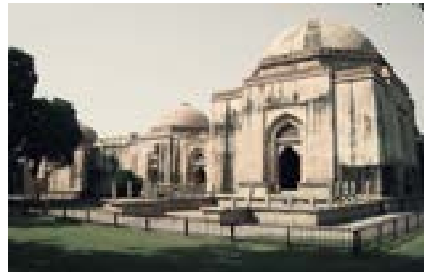
Tomb of Firoz Shah Tughluq

Firoz, the son of Ghiyas-ud-din's younger brother, succeeded Muhammad-bin-Tughluq. Firoz could neither suppress revolts nor win back the provinces that had broken away. He also showed no interest in re-conquering the southern provinces. He refused to accept an invitation (c. 1365) from a Bahmani prince to intervene in the affairs of the Deccan. Firoz rewarded Sufis and other religious leaders generously and listened to their advice. He also created charities to aid poor Muslims, built colleges, mosques, and hospitals. He adopted many humanitarian measures. He banned inhuman punishments and abolished taxes not recognised by Muslim law.