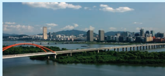
Skyline of Seoul city near the Han River

The South Korean brands such as Samsung, LG and Hyundai have become renowned in India. Numerous agreements between India and South Korea signify their growing commercial and cultural ties. Find out about major agreements signed in the recent past.