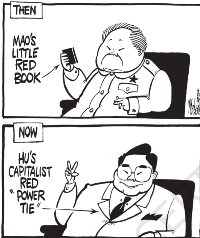
China then and now