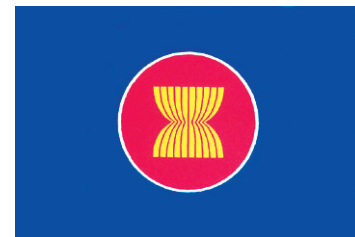
The ASEAN Flag

Locate the ASEAN members on the map. Find the location of the ASEAN Secretariat.