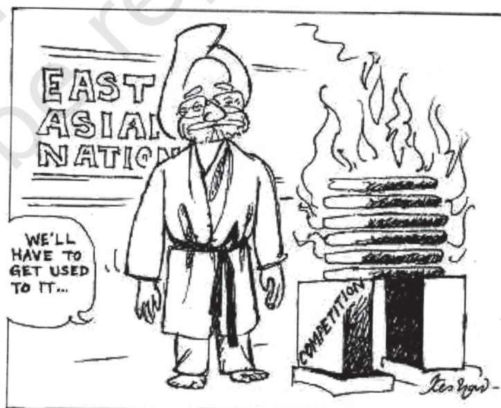
Keshav, The Hindu

India's 'Look East' Policy since the early 1990s and 'Act East' Policy since 2014 have led to greater economic interaction with the East Asian nations (ASEAN, China, Japan and South Korea).