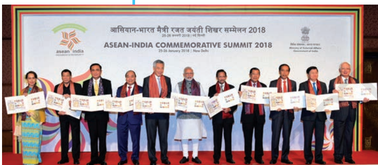
Leaders release postal stamps to commemorate silver jubilee of India and ASEAN partnership in New Delhi on 25 January 2018

Thailand. The ASEAN-India FTA came into effect in 2010. ASEAN's strength, however, lies in its policies of interaction and consultation with member states, with dialogue partners, and with other non-regional organisations. It is the only regional association in Asia that provides a political forum where Asian countries and the major powers can discuss political and security concerns.