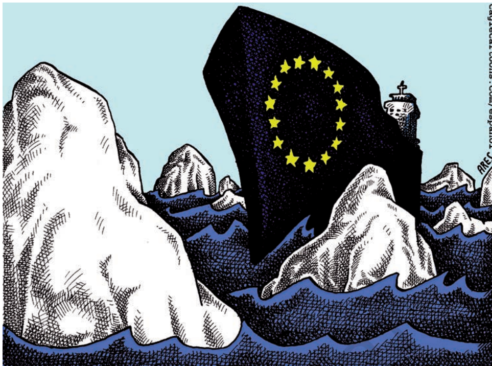
The cartoon appeared in 2003 when the European Union's initiative to draft a common constitution failed. Why does the cartoonist use the image of the ship Titanic to represent EU?

of Europe about the EU's integrationist agenda. Thus, for example, Britain's former prime minister, Margaret Thatcher, kept the UK out of the European Market. Denmark and Sweden have resisted the Maastricht Treaty and the adoption of the euro, the common European currency. This limits the ability of the EU to act in matters of foreign relations and defence.