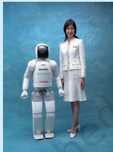
ASIMO, the world's most advanced humanoid robot, walking with a person while holding hand

Also find out about major agreements signed during high-level bilateral visits between the two nations in the recent past.