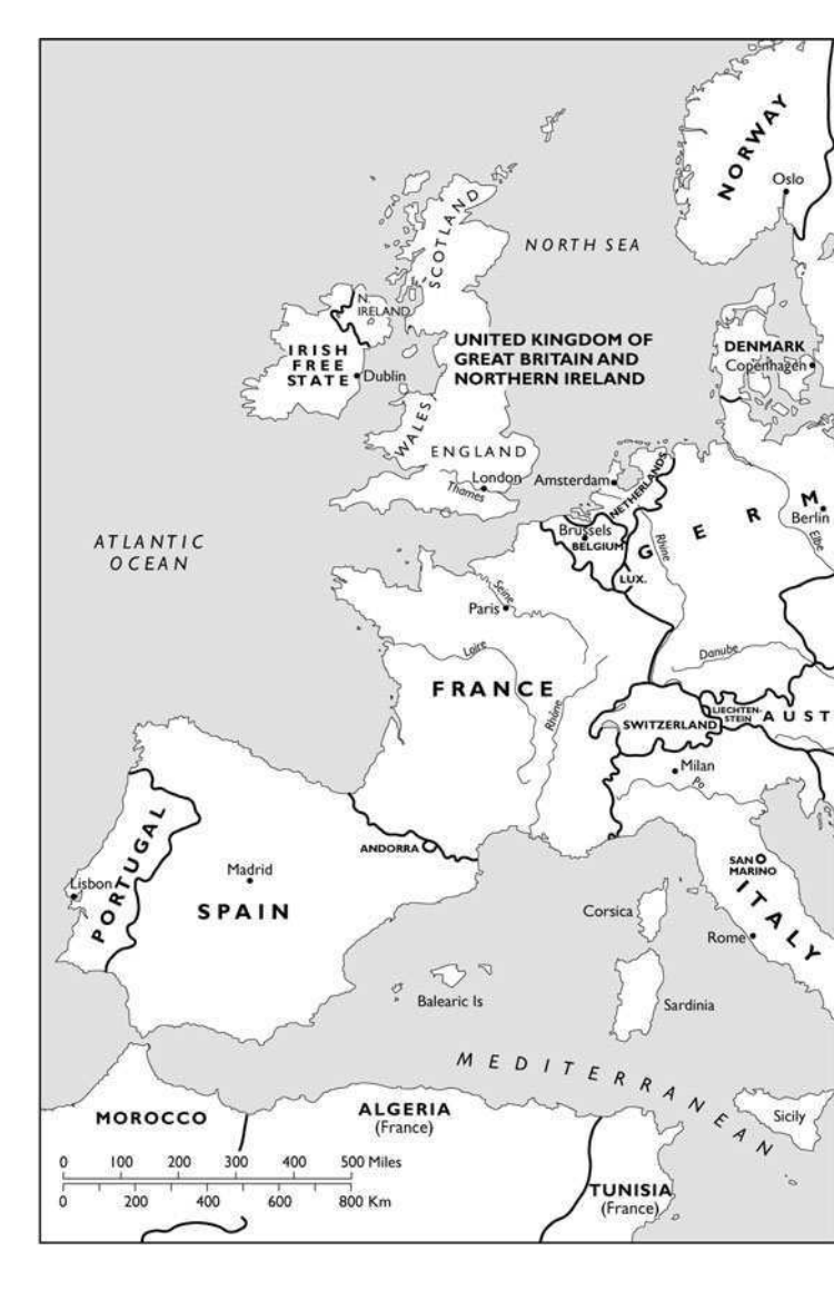
2. Europe after the war