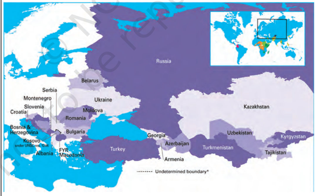
MAP OF CENTRAL, EASTERN EUROPE AND THE COMMONWEALTH OF INDEPENDENT STATES

Locate the Central Asian Republics on the map.