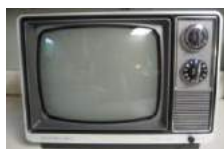
Black & White TV

For example: Black and White TV to Flat screen, high definition TV.