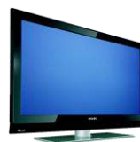
High Definition TV