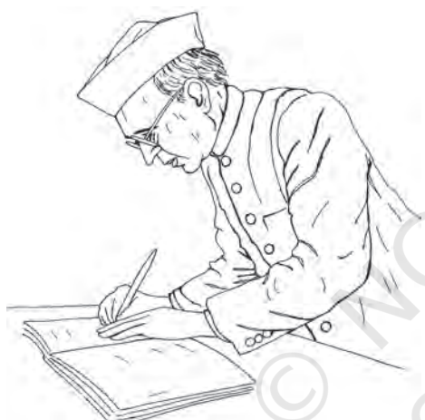
Jawaharlal Nehru CAD, Vol. VI, p. 734

We have already seen that President is the formal head of the government. In this formal sense, the President has wide ranging executive, legislative, judicial and emergency powers. In a parliamentary system, these powers are in reality used by the President only on the advice of the Council of Ministers. The Prime Minister and the Council of Ministers have support of the majority in the Lok Sabha and they are the real executive. In most of the cases, the President has to follow the advice of the Council of Ministers.