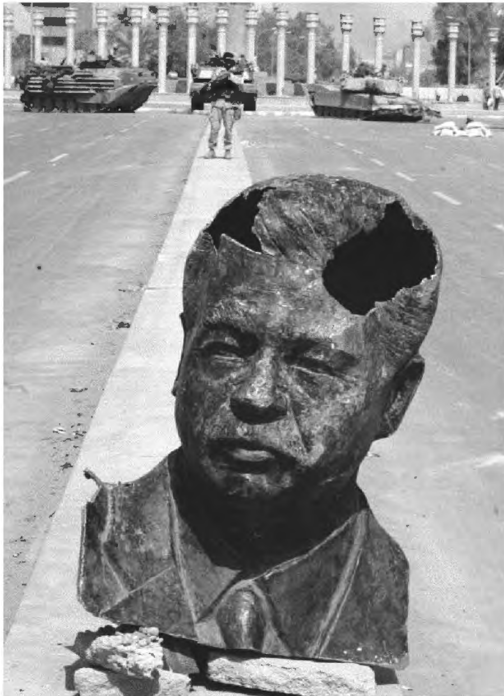
Illustration 12.2 The sculpted head of Saddam Hussein sits in the middle of the road in Baghdad, Iraq, 10 April 2003

January 2004 Paul O'Neill, a former US Treasury secretary who was sacked at the end of 2002 because he disagreed with the rest of the cabinet over Iraq, made some sensational revelations. He claimed that Bush had been determined to oust Saddam as far back as January 2001 when he took office, and that 11 September provided a convenient justification. Talk of the threat of weapons of mass destruction was merely a cover, since the cabinet knew perfectly well that Saddam had no such weapons of any significance. Thus the main justification for the war given by Bush and Blair seemed to have been invalidated.