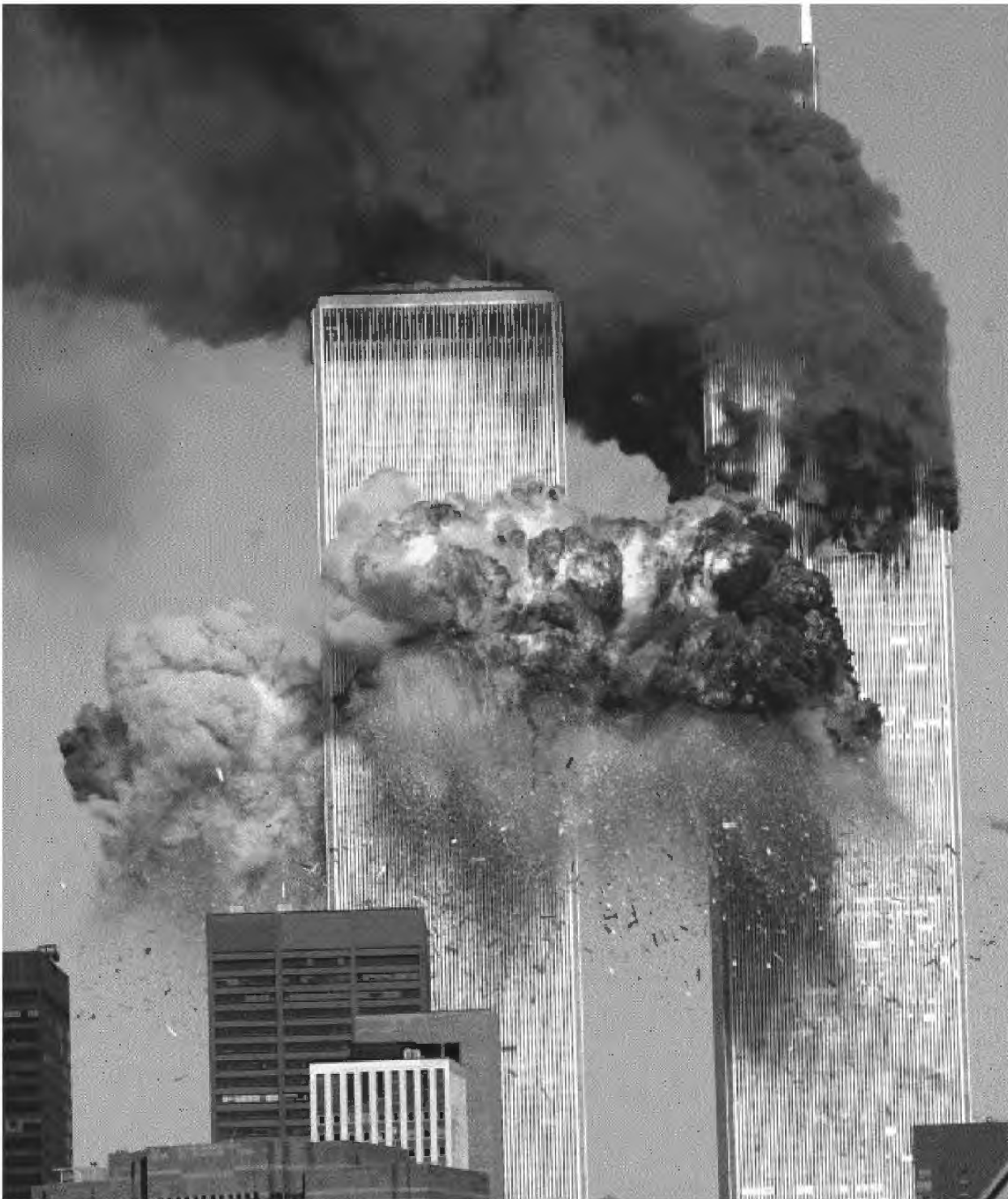
Illustration 12.1 New York, 11 September 2001: a fiery blast rocks the south tower of the World Trade Center as the hijacked United Airlines flight 175 from Boston crashes into the building

this attack was placed on al-Qaeda (meaning ‘the Base’), an Arab organization led by Osama bin Laden , which was campaigning against Western or anti-Islamic interests. US president George W. Bush immediately announced ‘a declaration of war on terrorism’. His aims were to overthrow the Taliban (students) regime in Afghanistan, which was thought to be aiding and abetting al-Qaeda, to capture Osama bin Laden and to destroy al-Qaeda. Bush also threatened to attack and overthrow any regime that encouraged or harboured terrorists. First on the list was to be Saddam Hussein of Iraq, and action was also threatened against Iran and North Korea – three states which, according to Bush, formed an ‘axis of evil’.