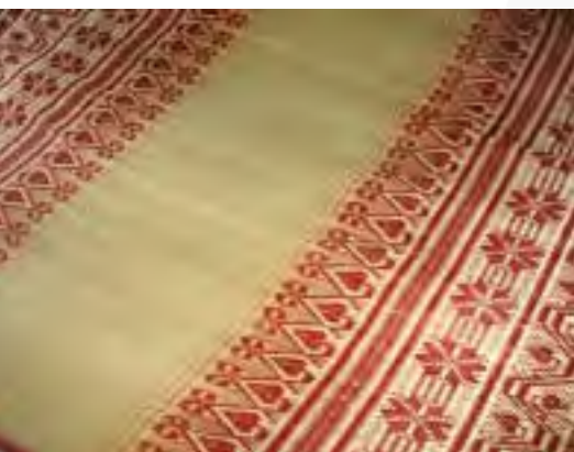
Shital pati, Assam