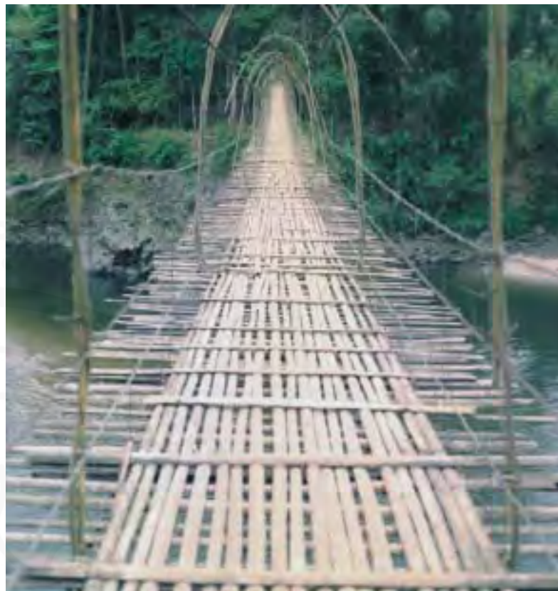
Cane-and-bamboo suspension bridge over a torrential river in Along, Arunachal Pradesh

Canes are long slender stems of climbing plants which belong to the palm family. India has about 30 species of cane growing in Assam, Arunachal Pradesh, the Andamans, Nagaland, Manipur, Mizoram, Meghalaya, Kerala, Karnataka and Tamil Nadu.