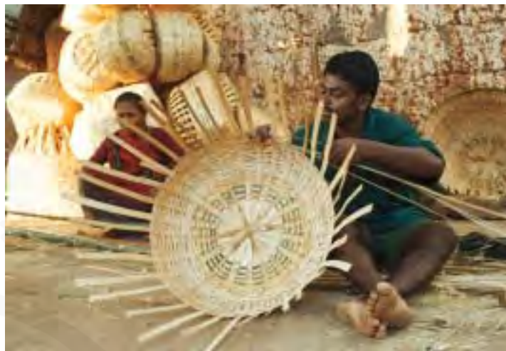
Traditional bamboo craftspersons, Orissa