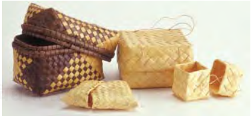
Boxes made of palm strips for various uses