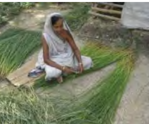
Mat weaver separating the stem of the sedge or kathi from the leaf stalk, West Bengal

Korai (Tamil Nadu) or kora (Kerala) also of the Cyperaceae family is a sedge or wetland plant which is cultivated in the southern districts of Tamil Nadu. The stems are cut near the base of the plant, spliced vertically and dried in the sun. On drying the spliced stems curl into a smooth and tubular form. A large variety of mats with stripes, geometrical motifs, natural and dyed colours are woven in several districts of Tamil Nadu and Kerala. The mats are woven on horizontal floor looms. The ribbed natural coloured mats are popularly used as floor coverings.