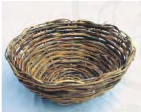
A shallow circular basket made from whole cane