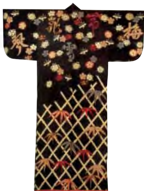
A traditional Japanese kimono

The bamboo and cane crafts of the North Eastern region of India represent a large storehouse of forms and traditional