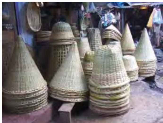
Functional products made of ekra bamboo by the Khasis of Meghalaya

Bamboo craft practised by both men and women is a traditional and hereditary source of livelihood for several people in the states from Gujarat in the west to Assam in the east, and Uttar Pradesh in the north to Kerala in the south.