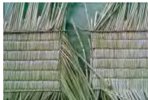
Unfinished reed mat, Manipur

Kauna is the local name for a reed or rush belonging to the family Cyperaceae which is cultivated in the wetlands of the Imphal valley. It has a cylindrical, soft and spongy stem which is woven into mats, square and rectangular cushions and mattresses by the women of the Meitei community of Manipur. The raw material for the craft is obtained by simple processing wherein the reed is cut near the base of the plant and dried in the sun. It is also smoked if it is to be preserved and stored for a longer time. The mats are woven by interlacing the stalks with jute threads using basic and simple tools. The mats and cushions have a unique edge finishing which is done by hand.