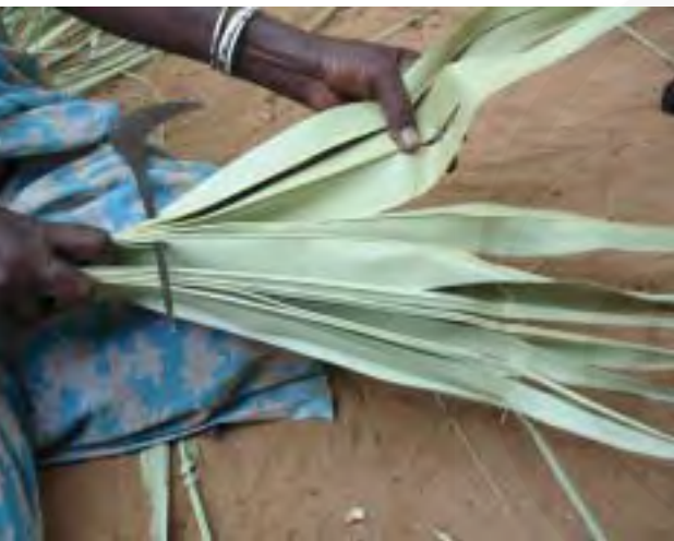
An artisan making strips of the palm leaf by inserting a knife in the leaf fold and separating the leaf from the midrib

A large variety of baskets, containers, mats and furniture are made from the leaves and stem of trees and plants belonging to the palm family.