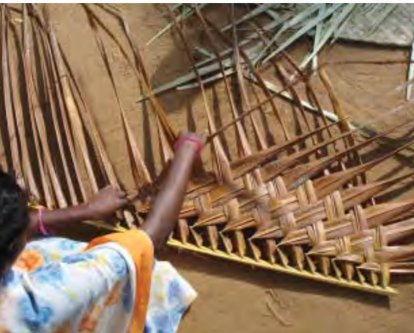
The pinnate or compound leaves being woven together

There are male and female species of the screw pine. The female screw pine produces a finer quality of fibre used in weaving traditional mats called mettha pai which are soft and cool to sleep on. The male screw pine produces coarser fibre. In Thazava in Kollam district of Kerala, double layer mats are made which are edged with a vivid coloured strip used to stitch the layers together. The white mat is burnished with a stone that gives it a polish.