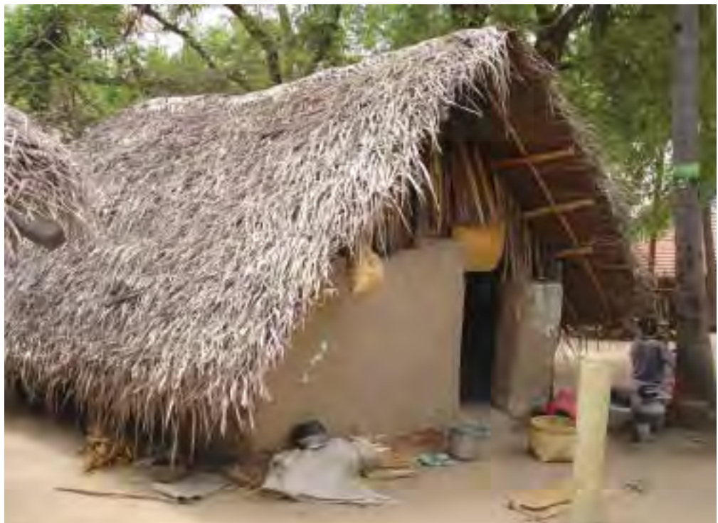
A palm-leaf craftsman's house, Tamil Nadu

The local population of coastal Tamil Nadu is known for judiciously using every part of the palm tree for a wide range of applications—the trunk is used in local architecture and for making rafts; the leaves are used whole as roof thatch and wall panels while strips are woven into baskets, winnowing trays and for packaging fish and jaggery. Palm oil and palm fruit are edible products.