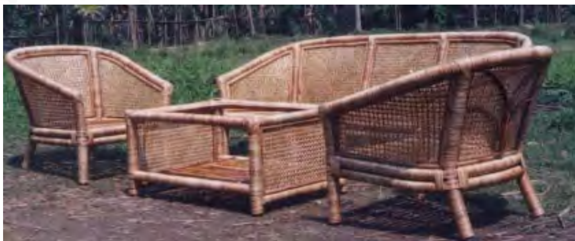
Cane furniture made by skilled craftsmen, Nagaland