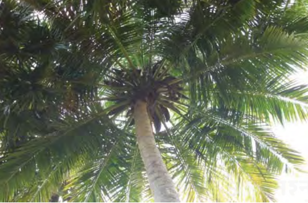
The coconut palm tree grows wild.