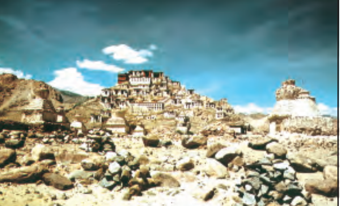
Fig. 10.5 Thiksey Monastery

winter months is so harsh that people keep themselves engaged in festivities and ceremonies. The women are very hard working. They work not only in the house and fields, but also manage small business and shops. Leh, the capital of Ladakh is well connected both by road and air. The National Highway 1A connects Leh to Kashmir Valley through the Zoji la Pass. Can you name some more passes in the Himalayas?