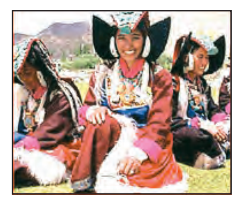
Fig. 10.6. Ladakhi Women in Traditional Dress

Life of people is undergoing change due to modernisation. But the people of Ladakh