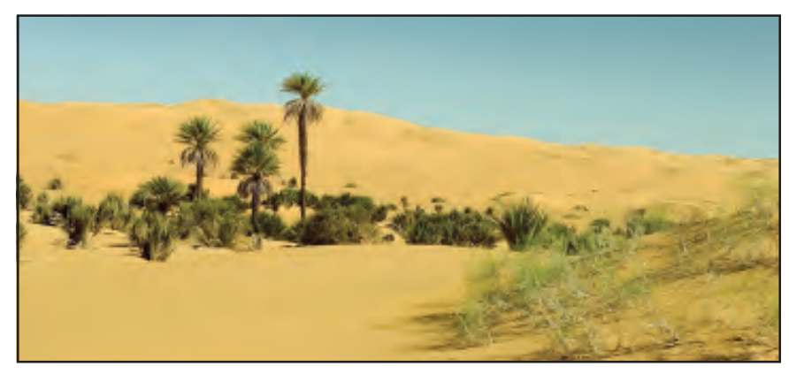
Fig. 10.3: Oasis in the Sahara Desert

snakes and lizards are the prominent animal species living there.