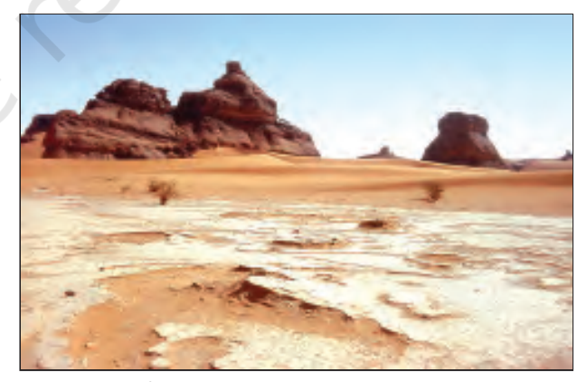
Fig. 10.1: The Sahara Desert

that immediately comes to your mind is that of sand. But besides the vast stretches of sands, that Sahara desert is covered with, there are also gravel plains and elevated plateaus with bare rocky surface. These rocky surfaces may be more than 2500m high at some places.