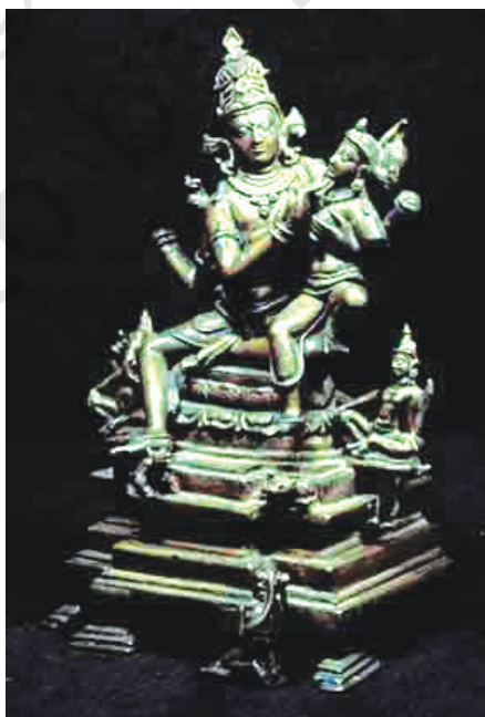
Shiva Family, tenth century CE, Bihar

Many standing Buddha images with right hand in abhaya mudra were cast in North India, particularly Uttar Pradesh and Bihar, during the Gupta and Post-Gupta periods, i.e., between the fifth, sixth and seventh centuries. The sanghati or the monk's robe is wrapped to cover the shoulders which turns over the right arm, while the other