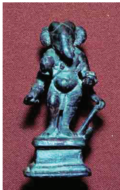
Ganesh, seventh century CE, Kashmir