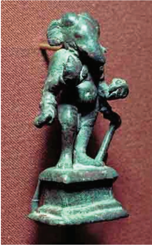
Ganesh, Kashmir, seventh century CE

Andhra Pradesh in the third century CE and at the same time there is a significant change in the draping style of the monk's robe. Buddha's right hand in abhaya mudra is free so that the drapery clings to the right side of the body contour. The result is a continuous flowing line on this side of the figure. At the level of the ankles of the Buddha figure the drapery makes a conspicuous curvilinear turn, as it is held by the left hand.