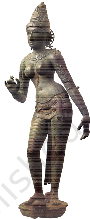
Devi, Chola bronze, Tamil Nadu

Vakataka bronze images of the Buddha from Phophnar, Maharashtra, are contemporary with the Gupta period bronzes. They show the influence of the Amaravati style of