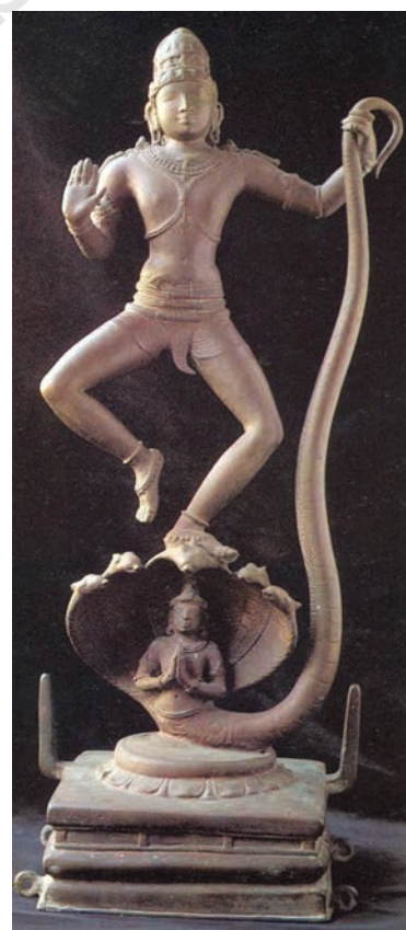
Kaliyadaman, Chola bronze, Tamil Nadu

Gujarat and Rajasthan have been strongholds of Jainism since early times. A famous hoard of Jain bronzes was found at Akota, on the outskirts of Baroda, dated between