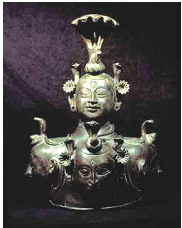
Bronze sculpture, Himachal Pradesh

A noteworthy development is the growth of different types of iconography of Vishnu images. Four-headed Vishnu, also known as Chaturanana or Vaikuntha Vishnu , was worshipped in these regions. While the central face represents Vasudeva,