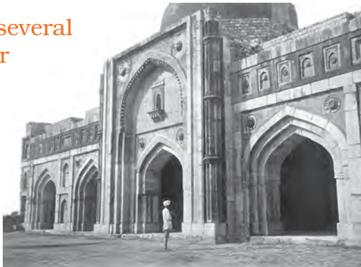
Fig. 4 Moth ki Masjid, built in the reign of Sikandar Lodi by his minister.

The Delhi Sultans built several mosques in cities all over the subcontinent. These demonstrated their claims to be protectors of Islam and Muslims. Mosques also helped to create the sense of a community of believers