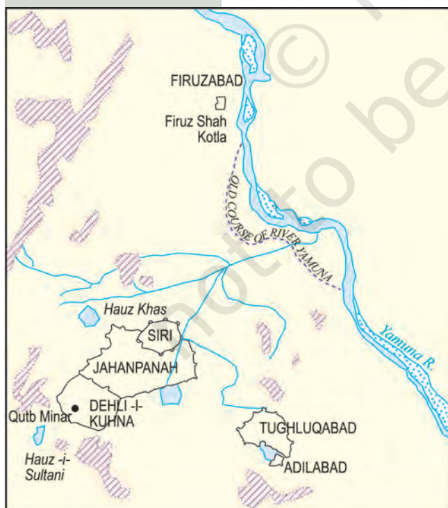
Map 1 Selected Sultanate cities of Delhi, thirteenth-fourteenth centuries.

The Delhi Sultans built many cities in the area that we now know as Delhi. Look at Map 1 and locate Dehli-i Kuhna, Siri and Jahanpanah.