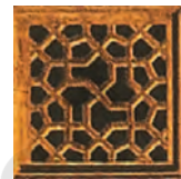
Fig. 5 Mosque of Jamali Kamali, built in the late 1520s.

who shared a belief system and a code of conduct. It was necessary to reinforce this idea of a community because Muslims came from a variety of backgrounds.