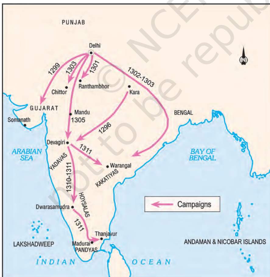
Map 3 Alauddin Khalji's campaign into south India.

By the end of Muhammad Tughluq’s reign, 150 years after somewhat humble beginnings, the armies of the Delhi Sultanate had marched across a large part of the subcontinent. They had defeated rival armies and seized cities. The Sultanate collected taxes from the peasantry and dispensed justice in its realm. But how complete and effective was its control over such a vast territory?