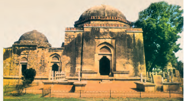
Firuz Shah Tughluq's tomb