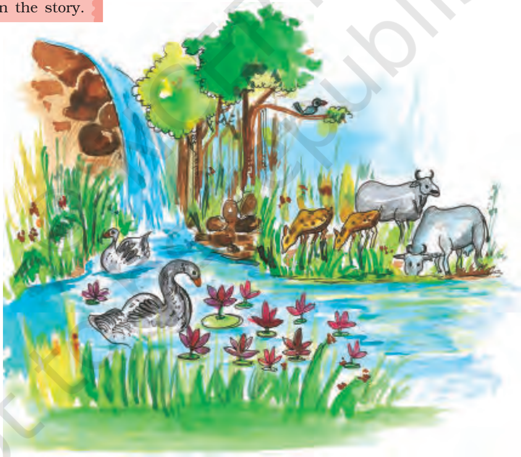
Fig. 1.3: A Pond Ecosystem

Heera from Jaisalmer exclaimed, "We get no rains. We see only 'kikar' and sand, as far as the eyes can see." "But you also find camels", said Ravi.