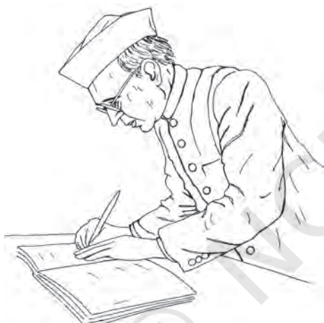
Jawaharlal Nehru CAD, Vol. VI, p. 734

We have already seen that President is the formal head of the government. In this formal sense, the President has wide ranging executive, legislative, judicial and emergency powers. In a parliamentary system, these powers are in reality used by the President only on the advice of the Council of Ministers. The Prime Minister and the Council of Ministers have support of the majority in the Lok Sabha and they are the real executive. In most of the cases, the President has to follow the advice of the Council of Ministers.