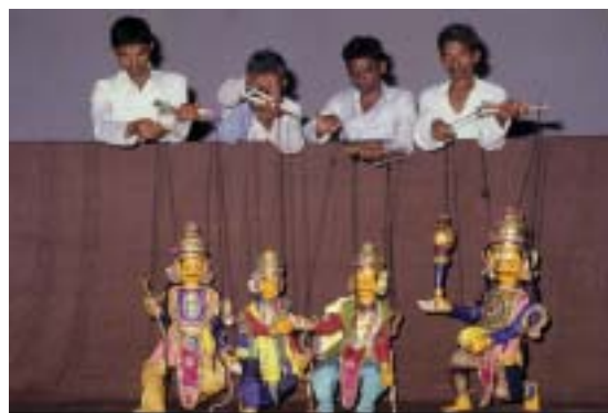
String puppets, Karnataka