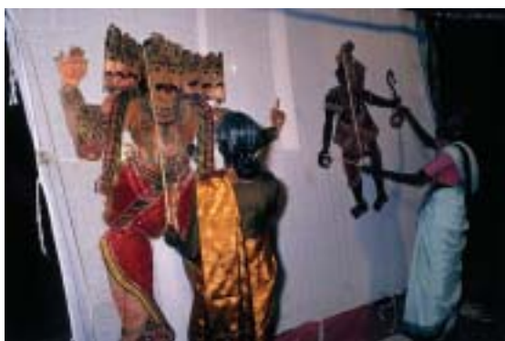
Shadow puppets, Andhra Pradesh