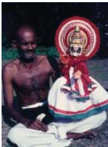
Glove puppet, Kerala