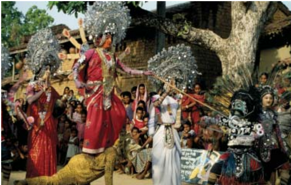
Chhau performance, West Bengal

ñ Extract from an article on Chhau by RAM RAHMAN