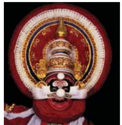
Kathakali mask, Kerala

From the delicate pastel coloured masks and shimmering head-dresses worn by Chhau dancers to the demon dance masks of the Buddhist monasteries of Ladakh to the inexpensive animal masks of papier-mâché available in our cities, India has a vast and ancient tradition of masks and make-up for rituals and theatre.