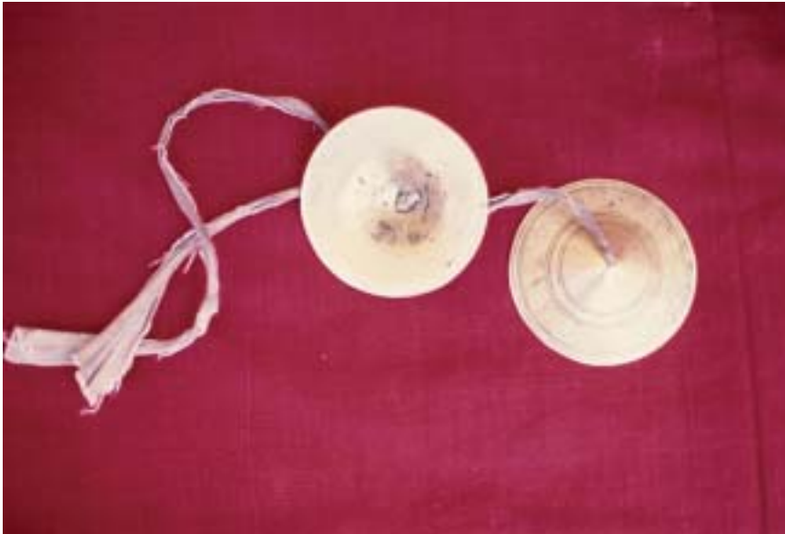
A pair of manjeeras

two similar pieces of wood with brass fittings. One piece of it has space for a thumb, the other for four fingers, these are struck together to produce a simple percussive beat. It is easy to see the close resemblance between a khadtaal and the Spanish castanets, used as accompaniment for the famous Flamenco music and dance.