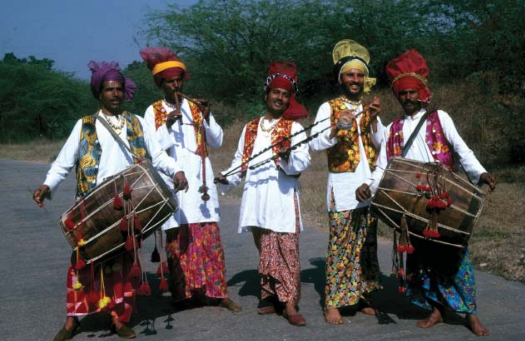
Musical instruments in Bhangra performance, Punjab