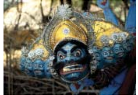
Masks, make-up and costumes

In this chapter we look at only a few of these to encourage you to look for and discover any similar traditions that exist in your own neighbourhood.