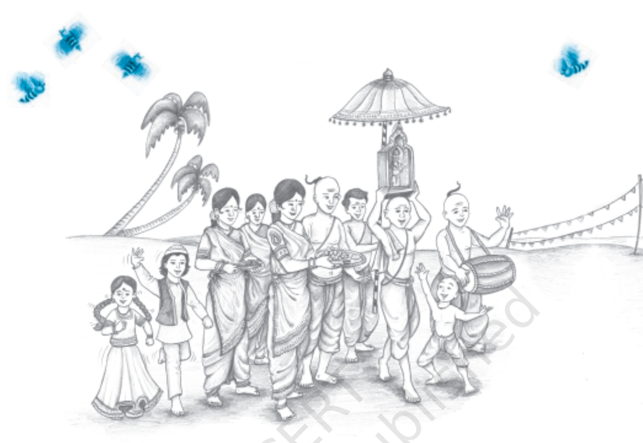
Our family used to arrange boats for carrying idols of the Lord from the temple to the marriage site.

father; Aravindan went into the business of arranging transport for visiting pilgrims; and Sivaprakasan became a catering contractor for the Southern Railways.