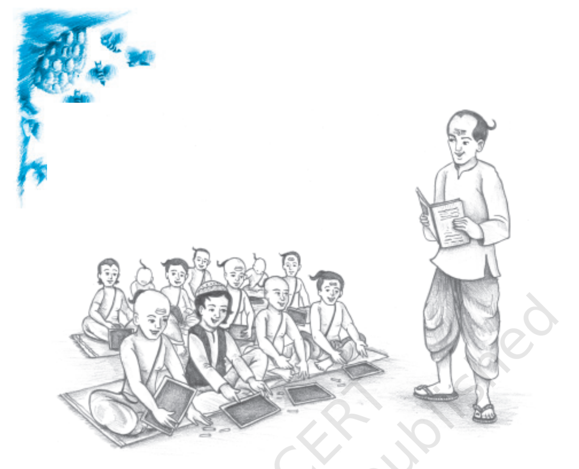
I always sat in the front row next to Ramanadha Sastry.