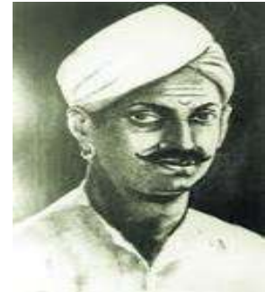
Mangal Pandey was hanged because he refused to use the greased cartridges.

Decline of Landed Aristocracy: The landed aristocracy such as the taluqdars and hereditary landlords were deprived of their estates. According to the provisions of the Inam Commission passed in 1852, about 20,000 estates were confiscated and were given to the highest bidder. In Awadh, landed aristocracy was deprived of its rights over land.