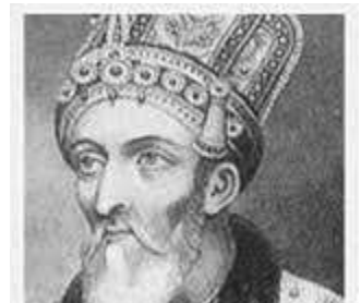
The announcement of Lord Canning that the sons of Bahadur Shah Zafar will not be recognised as the kings filled the hearts of many Indians with anger against the British rule.