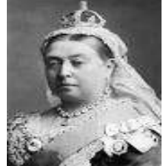
After the revolt of 1857, the control of Indian territories was transferred from the Company to the Crown.