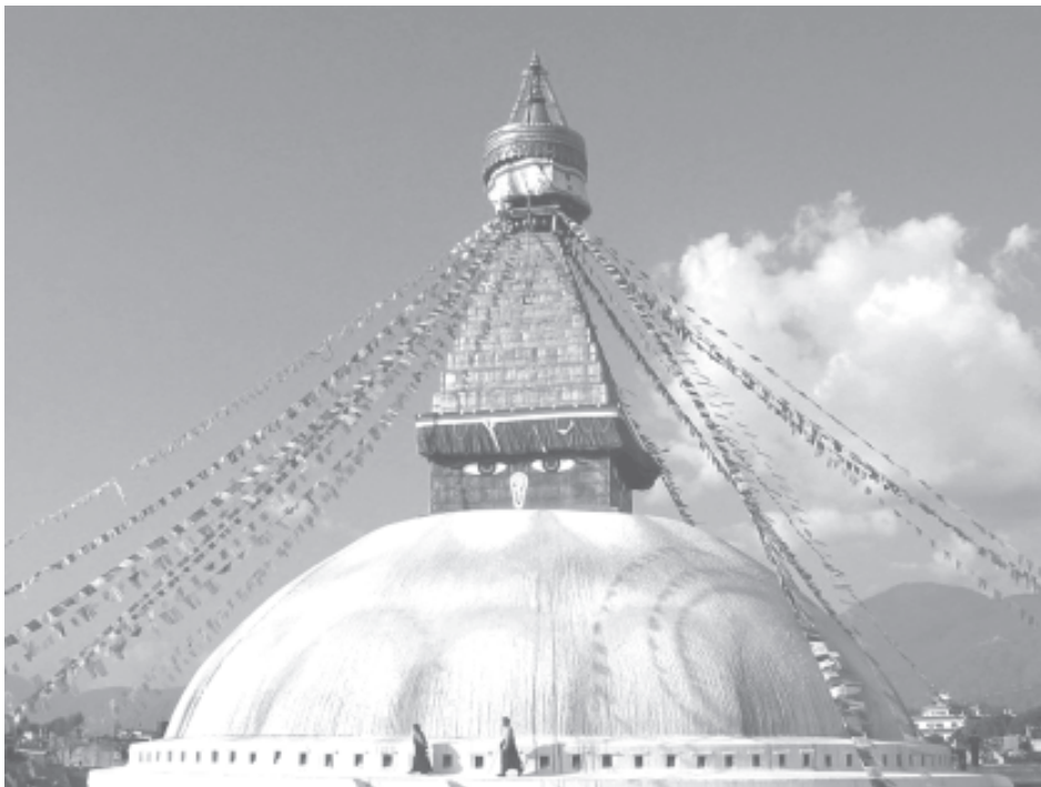
The Baudhnath Stupa, Kathmandu