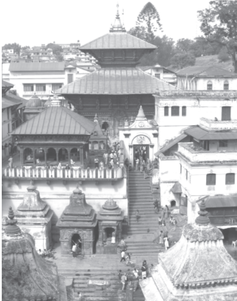
Pashupatinath Temple, Kathmandu

that flows below. A corpse is being cremated on its banks; washerwomen are at their work and children bathe. From a balcony a basket of flowers and leaves, old offerings now wilted, is dropped into the river. A small shrine half protrudes from the stone platform on the river bank. When it emerges fully, the goddess inside will escape, and the evil period of the Kaliyug will end on earth.