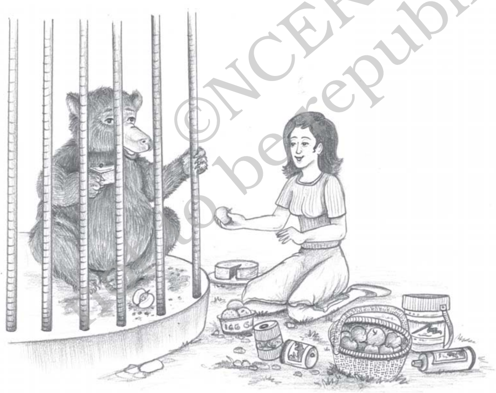
For the next three hours she would not leave that cage ...