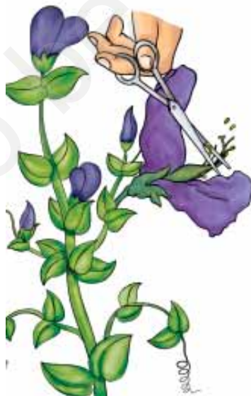
Fig. 12.1 Showing process of Emasculation