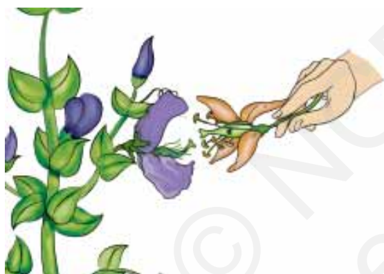
Fig. 12.3 Showing cross pollination on an emasculated flower