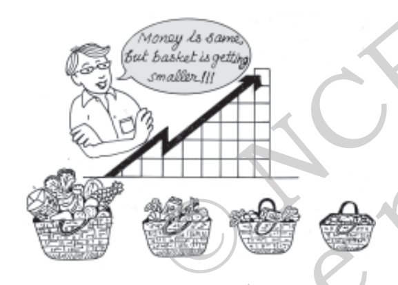
Example 2 Calculation of weighted aggregative price index

importance of items is taken care of. Here weights are quantity weights. To construct a weighted aggregative index, a well specified basket of commodities is taken and its worth each year is calculated. It thus measures the changing value of a fixed aggregate of goods. Since the total value changes with a fixed basket, the change is due to price change. Various methods of calculating a weighted aggregative index use different baskets with respect to time.