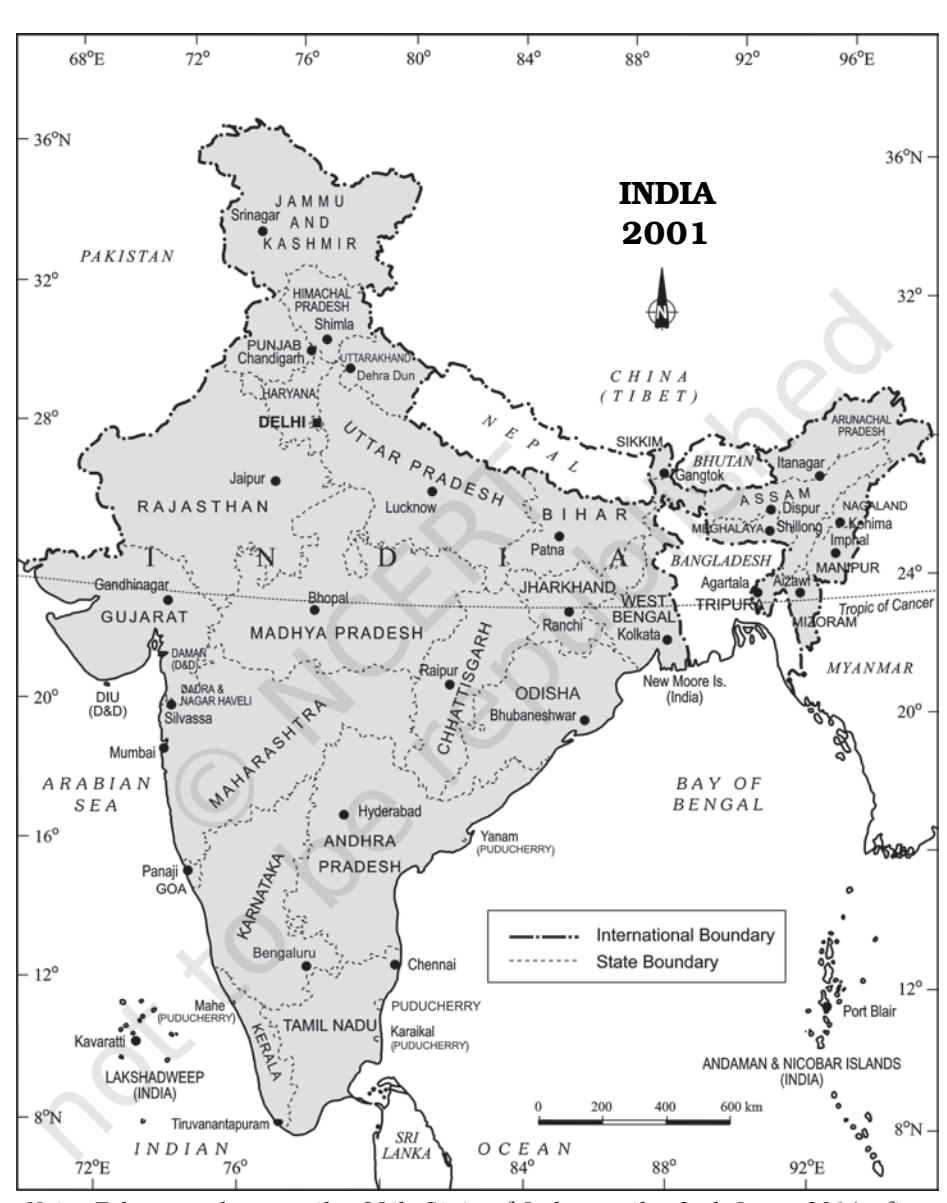
Note: Telangana became the 29 \mathrm{th} State of India on the 2 \mathrm{nd} June, 2014 after reorganisation of the State of Andhra Pradesh.