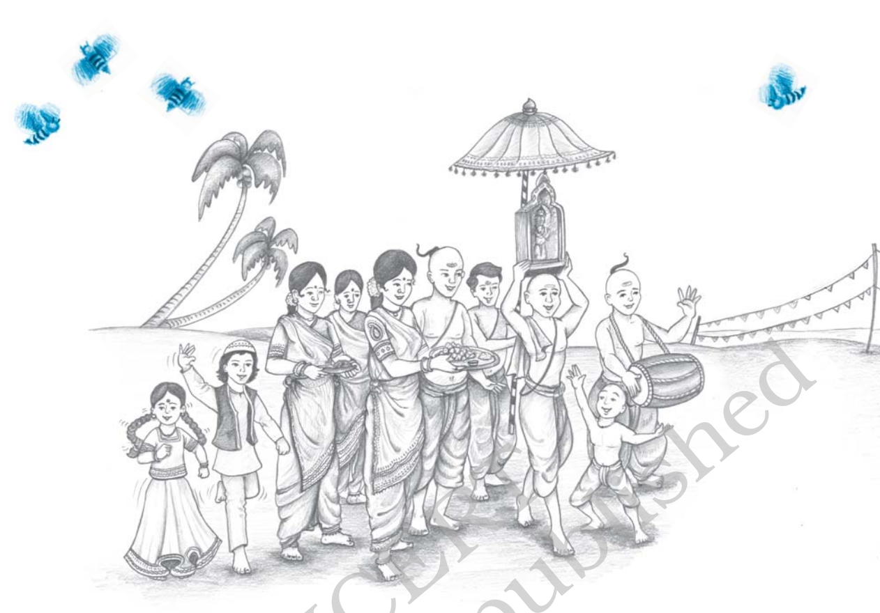
Our family used to arrange boats for carrying idols of the Lord from the temple to the marriage site.

father; Aravindan went into the business of arranging transport for visiting pilgrims; and Sivaprakasan became a catering contractor for the Southern Railways.