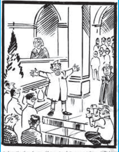
At last, I've been konourably acquitted! It was a nightmare all this time! I swear I'll never again indulgs in corruption!

How active is the judiciary in trying to curb corruption in public life?