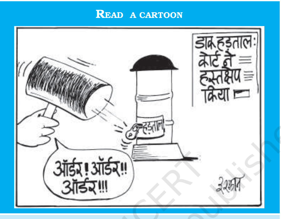
Do you know that in recent times the judiciary has ruled that bandhs and hartals are illegal?

The chief instrument through which judicial activism has flourished in India is Public Interest Litigation (PIL) or Social Action Litigation (SAL). What is PIL or SAL? How and when did it emerge? In normal course of law, an individual can approach the courts only if he/she has been personally aggrieved. That is to say, a person whose rights have been violated, or who is involved in a dispute, could move the court of law. This concept underwent a change around 1979. In 1979, the Court set the trend when it decided to hear a case where the case was filed not by the aggrieved persons but by others on their behalf. As this case involved a consideration of an issue of public interest, it and such other cases came to be known as public interest litigations. Around the same time, the Supreme Court also took up the case about rights of prisoners. This opened the gates for large number of cases where public spirited citizens and voluntary organisations sought judicial intervention for protection of existing rights, betterment of life conditions of the poor,