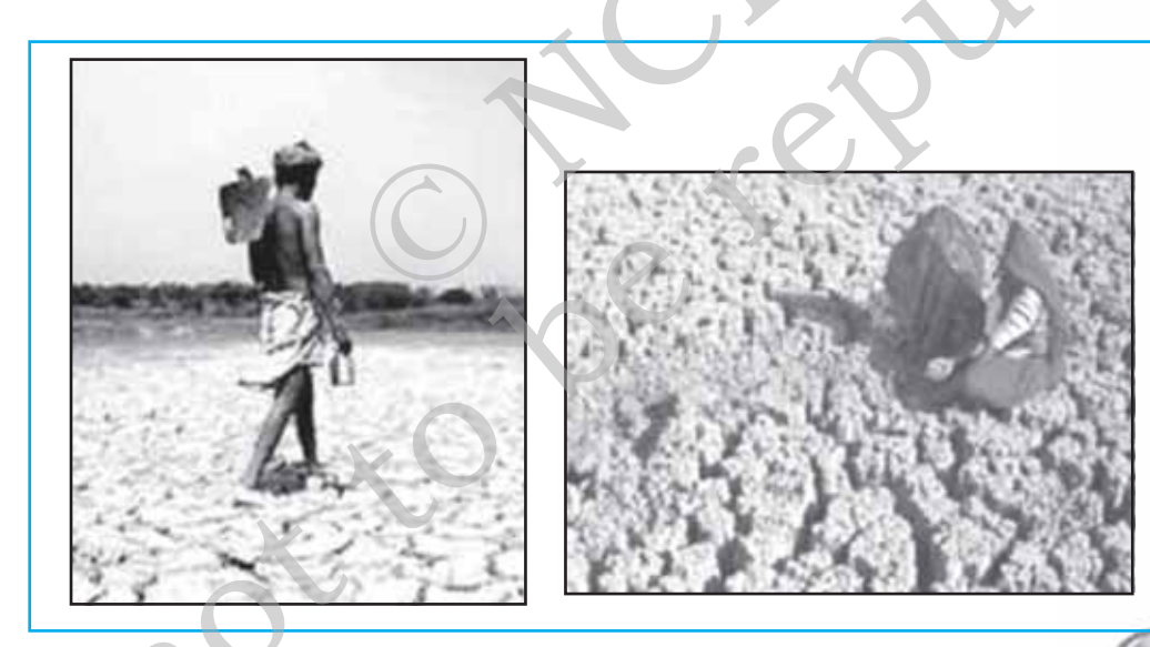
Fig. 5.4: Drought Affected Area

Drought, as commonly understood, is a condition of climatic dryness that is severe enough to reduce soil moisture and water below the minimum limit necessary for sustaining plant, animal and human life (Fig 5.4 and 5.5). It is usually accompanied by hot dry winds and may be followed by damaging floods.