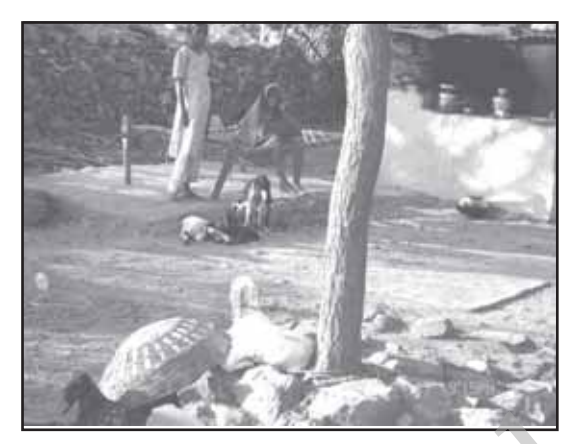
Fig. 5.1: A Poverty-ridden family

The study of extent, determinants and consequences of poverty can be carried out with the following objectives in mind: