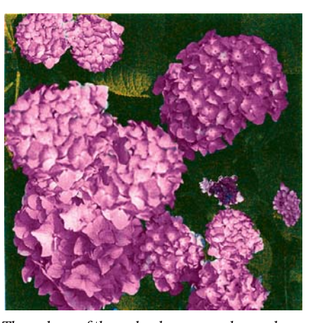
The colour of these hydrangeas depends on the pH of the soil in which they grow, If pH of soil is acidic, flowers are blue and in alkaline pH, flowers are pink.