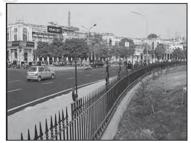
Fig. 4.4 : A view of the modern city

The British and other Europeans have developed a number of towns in India. Starting their foothold on coastal locations, they first developed some trading ports such as Surat, Daman, Goa, Pondicherry, etc. The British later consolidated their hold around three principal nodes – Mumbai (Bombay), Chennai (Madras), and Kolkata (Calcutta) – and built them in the British style. Rapidly