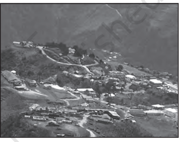
Fig. 4.2 : Semi-clustered settlements

Semi-clustered or fragmented settlements may result from tendency of clustering in a restricted area of dispersed settlement. More often such a pattern may also result from segregation or fragmentation of a large compact village. In this case, one or more sections of the village society choose or is forced to live a little away from the main cluster or village. In such cases, generally, the land-owning and dominant community occupies the central part of the main village, whereas people of lower strata of society and menial workers settle on the outer flanks of the village. Such settlements are widespread in the Gujarat plain and some parts of Rajasthan.