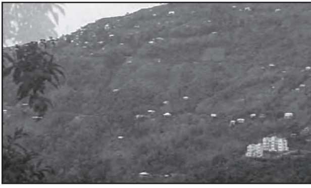
Fig. 4.3 : Dispersed settlements in Nagaland

with farms or pasture on the slopes. Extreme dispersion of settlement is often caused by extremely fragmented nature of the terrain and land resource base of habitable areas. Many areas of Meghalaya, Uttaranchal, Himachal Pradesh and Kerala have this type of settlement.