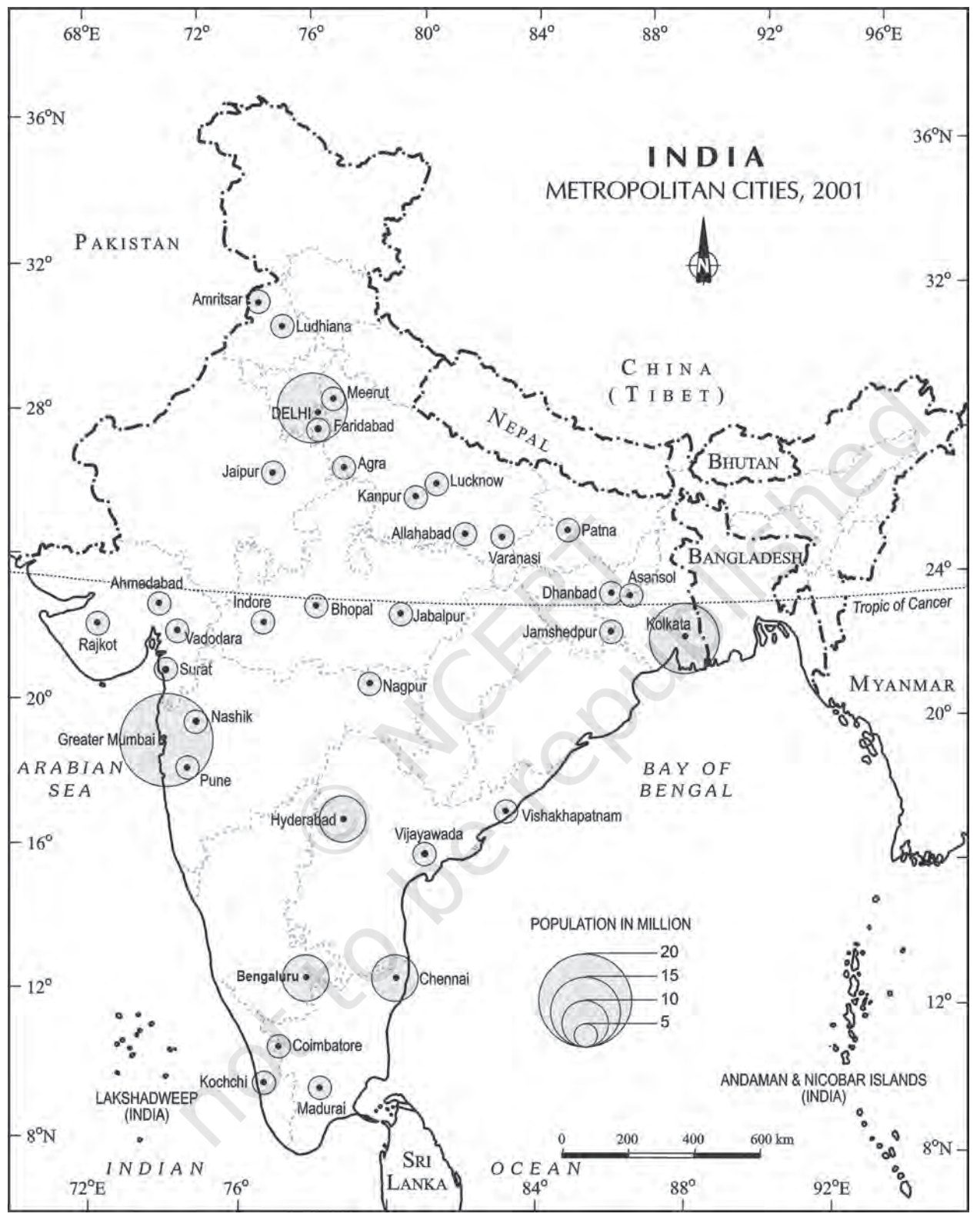
Fig. 4.5 : India – Metropolitan Cities, 2001