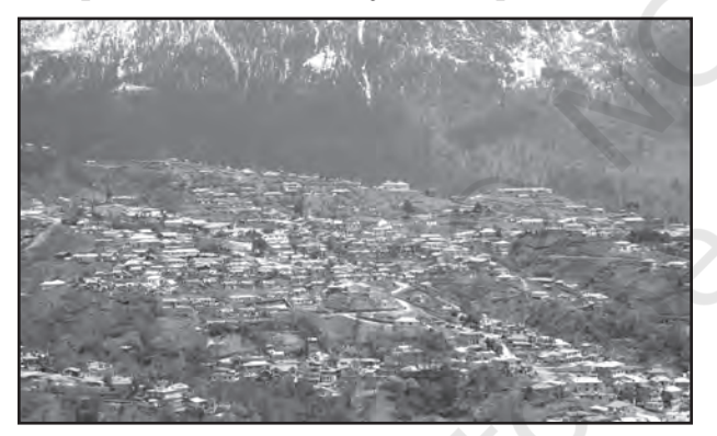
Fig. 4.1 : Clustered Settlements in the North-eastern states

The clustered rural settlement is a compact or closely built up area of houses. In this type of village the general living area is distinct and separated from the surrounding farms, barns and pastures. The closely built-up area and its