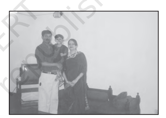
Notice how families and residences are different