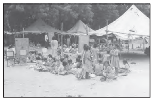
Discuss the visuals (Two types of schools)

For the sociologists who perceive society as unequally differentiated, education functions as a main