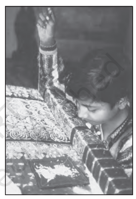
Discuss the visual

The report indicates how gender and caste discrimination impinge upon the chances of education. Recall how we began this book in Chapter 1 about a child's chances for a good job