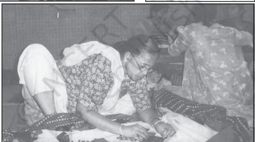
Types of Work

physical effort, which has as its objective the production of goods and services that cater to human needs.