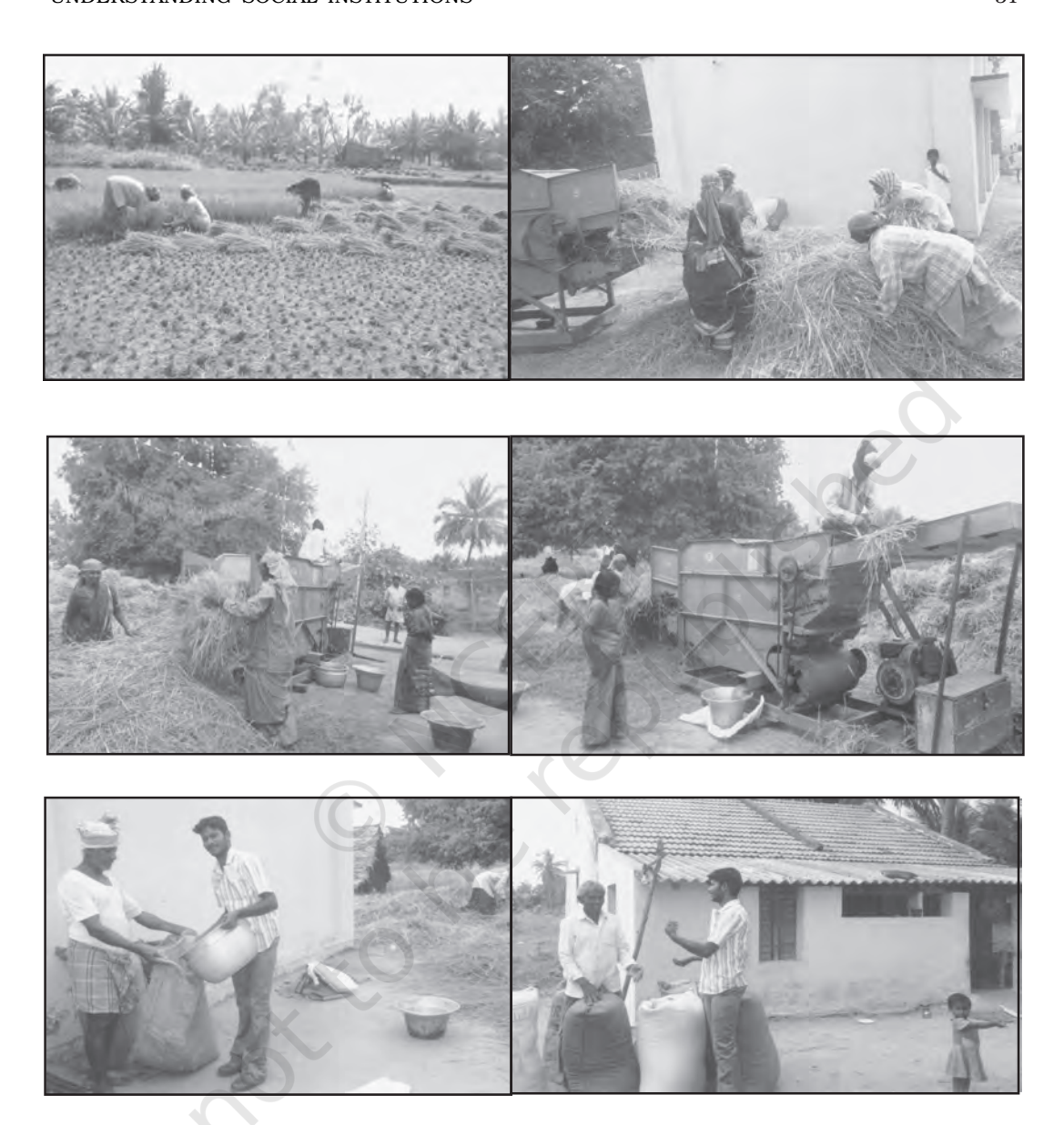
Threshing of paddy in a village