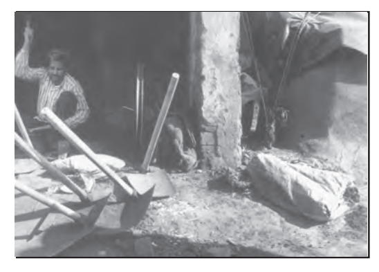
Work and Home