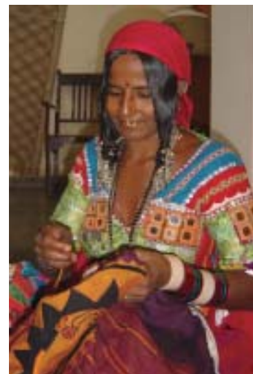
A Kutchi woman embroidering

The various tribes inhabiting the north-east of India live among the rich bamboo forests where the finest quality of skill in the weaving of bamboo, cane and other wild grasses can be seen. This group links itself culturally to the people