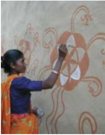
Wall and floor decoration in a house, Jharkhand