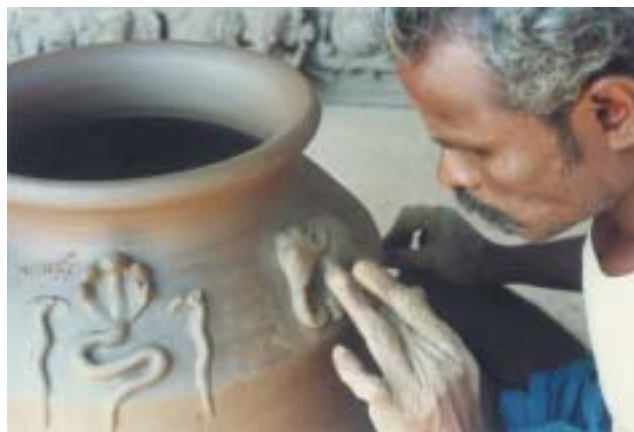
Traditional potter (above) and weaver (below) at work

In The Arts of India by G.C.M. Birdwood, he cites the nineteenth chapter of the second section (‘Ayodhyakanda’) of the Ramayana , to list the inhabitants of the city that are represented in the procession with Bharata to seek Rama. They are the trade guilds of artisans: the jewellers, potters, ivory-workers, perfumers, goldsmiths, weavers, carpenters, braziers, painters, musical instrument makers, armourers, curriers, blacksmiths, coppersmiths, makers of figures, cutters of crystals, glassmakers, inlayers and others. In present-day India we can formulate broad groupings of major practitioners of craft as potters, weavers, metal-smiths, wood-carvers, cane and bamboo weavers and stone carvers. While these may be the larger skills, there are many other crafts from shola pith work, papier-m, chÊ , innumerable styles of mural, miniature and floor painting, paper crafts, glass work, and carpet and duree weaving. In the area of textiles India undoubtedly has the largest range of skills that can be found anywhere in the world. While separating the craft of making floor coverings out of rags and yarn, we are left with textiles that consist of