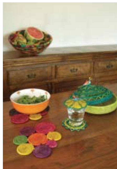
Baskets, mats, coasters designed for everyday use

There are many issues and areas of work involved in this story: child labour, women's work, the skill of basket making, designing new baskets, finding new uses for these baskets, calculating the cost of each basket so that they fetch a fair return without making the basket too expensive, planning a marketing strategy including an exhibition, a catalogue, web marketing, learning about the benefits of a self-help group and the availability of micro credit.