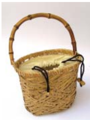
Bamboo basket, Vietnam

The textiles of the tribals of central India have their own distinct identity. The tribes of central India spin and weave thick cream coloured yarn with madder red borders and end pieces reflecting images from their lives. Birds, flowers, trees, deer or even an airplane decorate these cloths. In Orissa, ceremonial cloths to be worn by the priest or priestess are required to be of a certain colour. Each colour has an auspicious meaning and unity of communities is expressed through the similarity of dress and adornment.