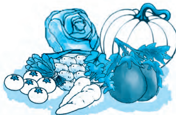
Fig. 1.2 : Healthy Diet

One must do 20–30 minutes of physical activity daily to keep fit. This can be done by taking part in sports. Exercising or spot jogging can be done at home. Simple walking, climbing stairs, not using the lift and skipping have the same effect. Gym is another dedicated place for workouts.