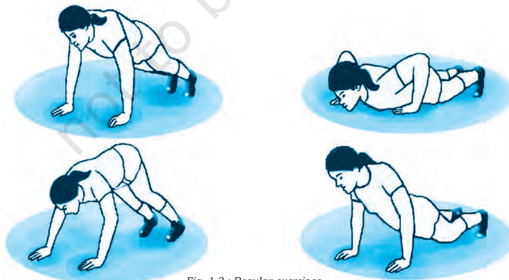
Fig. 1.3 : Regular exercises