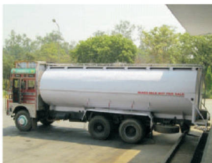
Road milk tanker