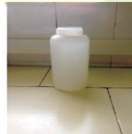
Milk sample bottle