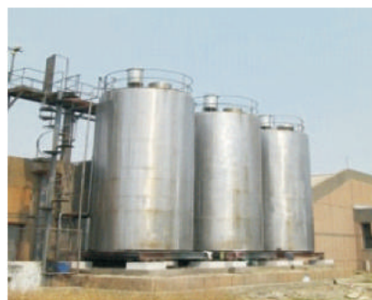
Milk storage tanks