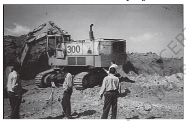
Fig. 12.2 : Noise monitoring at Panchpatmalai Bauxite Mine

The main sources of noise pollution are various factories, mechanised construction and demolition works, automobiles and aircraft, etc. There may be added periodical but polluting noise from sirens, loudspeakers used in various festivals, programmes