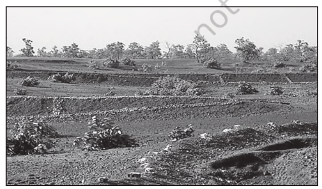
Fig. 12.4 : Trees planted on Common Property Resources in Jhabua

An interesting aspect of this experience is that before the community embarked upon the process of management of the pasture, there was encroachment on this land by a villager from an adjoining village. The villagers called the tehsildar to ascertain the rights of the common land. The ensuing conflict was tackled by the villagers by offering to make the defaulter encroaching on the CPR a member of their user group and sharing the benefits of greening the common lands/pastures. (See the section on CPR in chapter 'Land Resources and Agriculture').