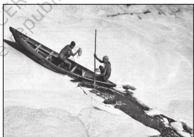
Fig.12.1 : Cutting Through Effluent : Rowing through a pervasive layer of foam on the heavily polluted Yamuna on the outskirts of New Delhi

Indiscriminate use of water by increasing population and industrial expansion has led degradation of the quality of water considerably. Surface water available from rivers, canals, lakes, etc. is never pure. It contains small quantities of suspended particles, organic and inorganic substances. When concentration of these substances increases, the water becomes polluted, and hence becomes unfit for use. In such a situation, the self-purifying capacity of water is unable to purify the water.