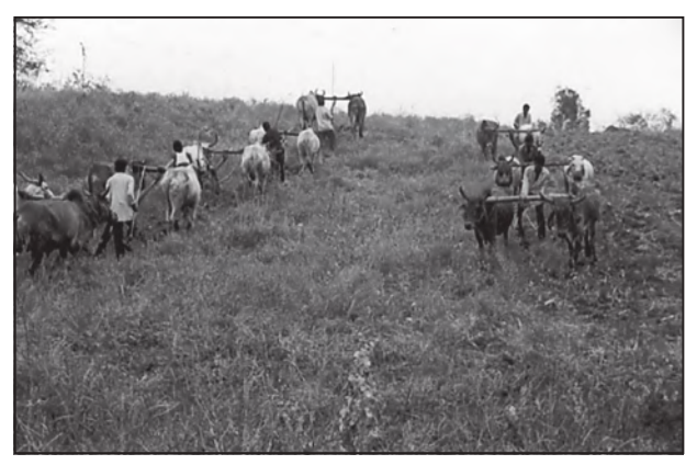
Fig. 12.5 : Community Participation for Land Leveling in Common Property Resources in Jhabua (ASA, 2004)