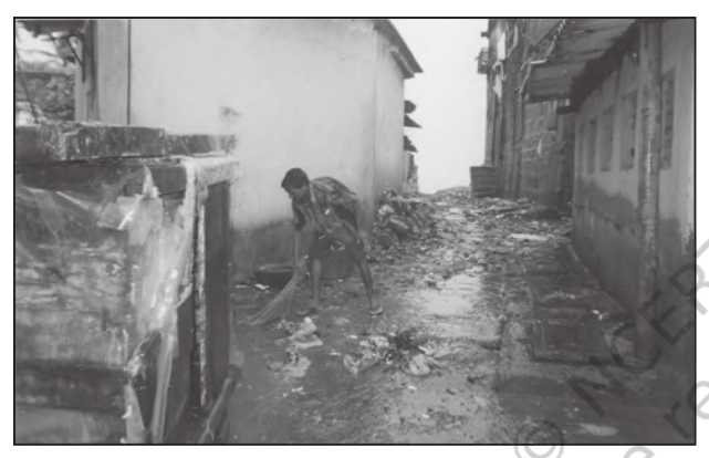
Fig. 12.3: A view of urban waste in Mahim, Mumbai