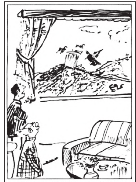
I moved into this second floor from the first to get a view of the sea and the garbage has piled up to this level obstructing the view.

Urban waste disposal is a serious problem in India. In metropolitan cities like Mumbai, Kolkata, Chennai, Bengaluru, etc., about 90 per cent of the solid waste is collected and disposed. But in most of other cities and towns